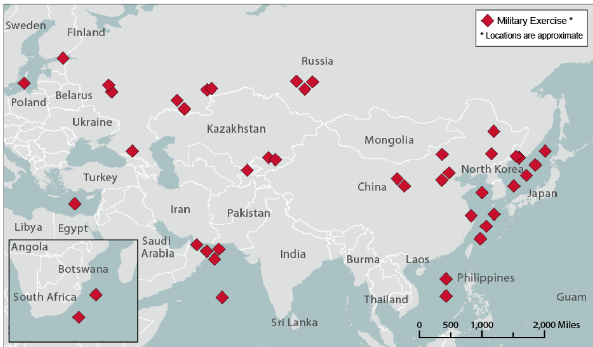
Figure 1. Publicly Reported Locations of Russia-PRC Military Exercises, 2012-2024

Sources: CRS, using data from media reports, think-tank studies, and official Russian and People’s Republic of China (PRC) press releases.