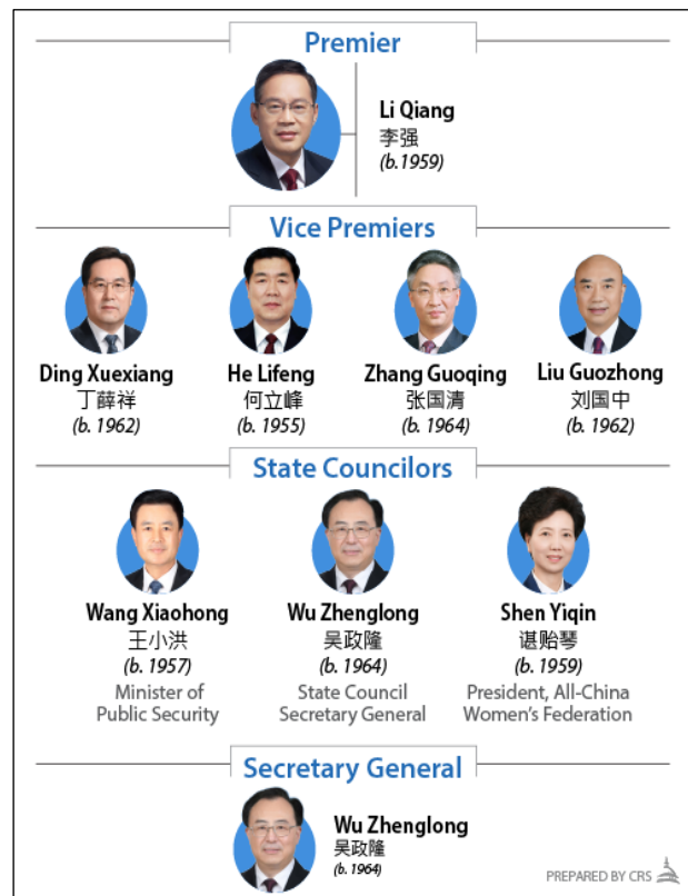
Figure 2. China's State Council Leadership

Current as of April 27, 2026.