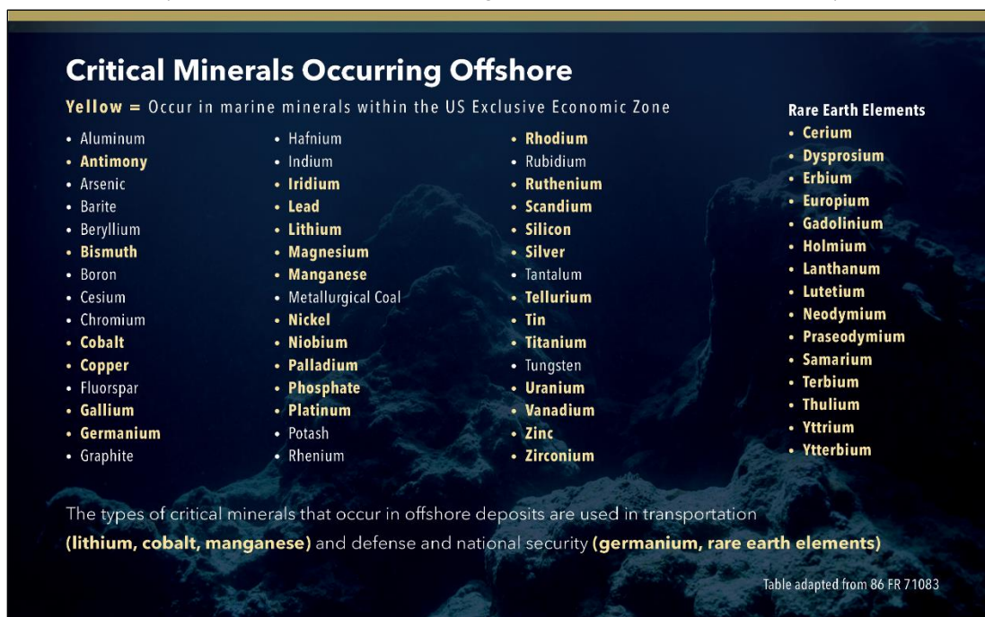
Figure 2. Critical Minerals Occurring Offshore (with subset of minerals occurring on the U.S. outer continental shelf)