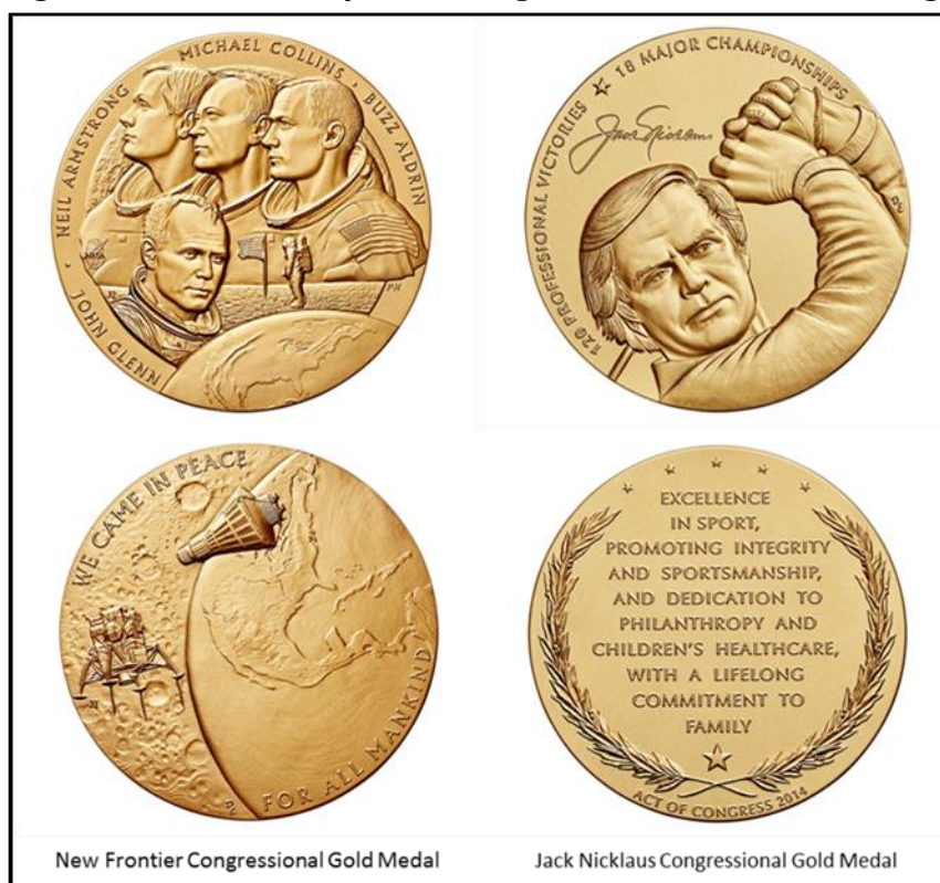
Figure 3. Recent Examples of Congressional Gold Medal Design