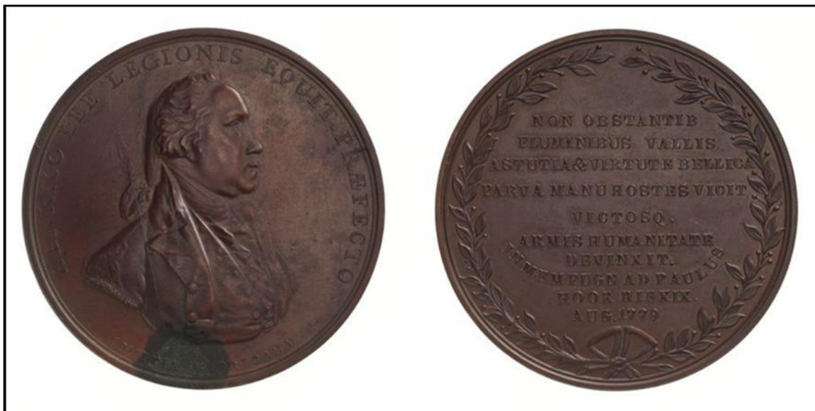
Figure 1. Major Henry Lee Congressional Gold Medal

Source: Museums Victoria (AUS) "Medal—Congressional Medal, Henry Lee, United States," Item NU 36568, https://collections.museumsvictoria.com.au/items/1382927 .