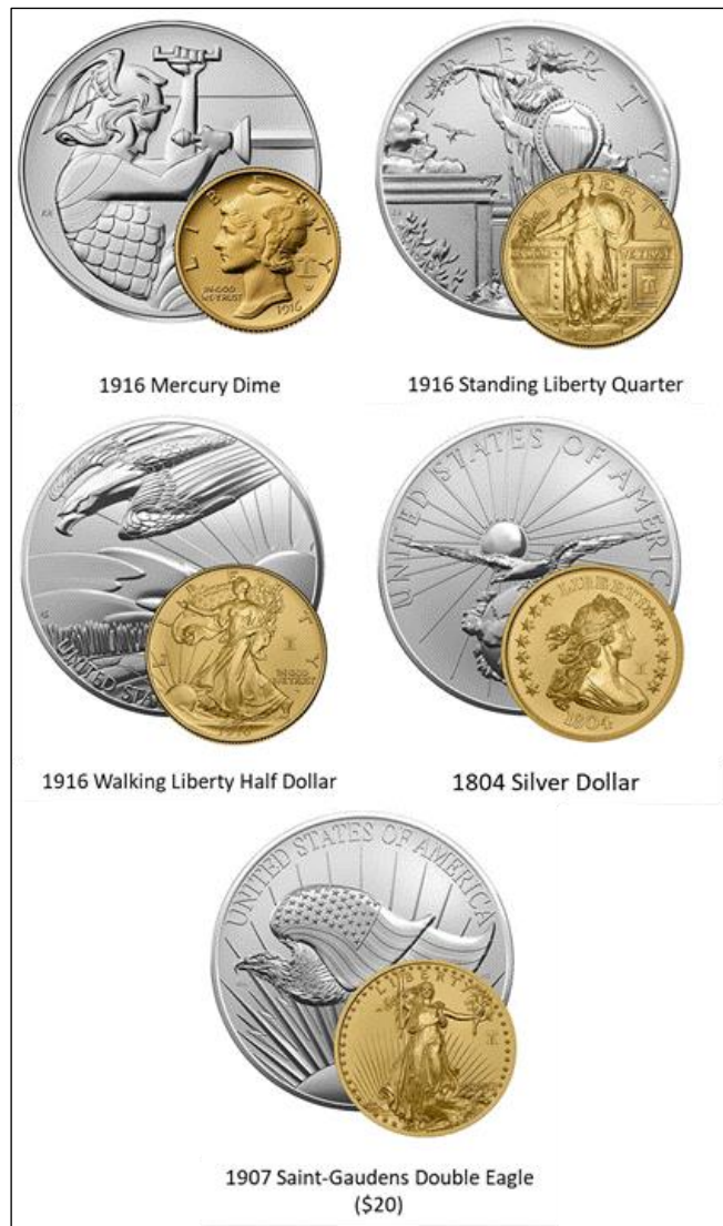
Figure 5. Best of the Mint Coins and Medals