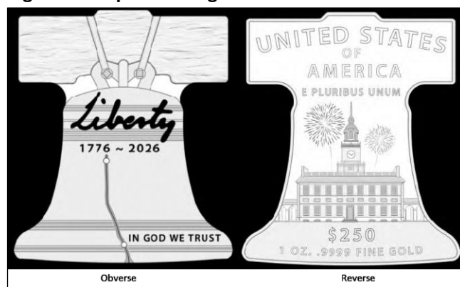
Figure 4. Proposed Design Nonround Gold Coin