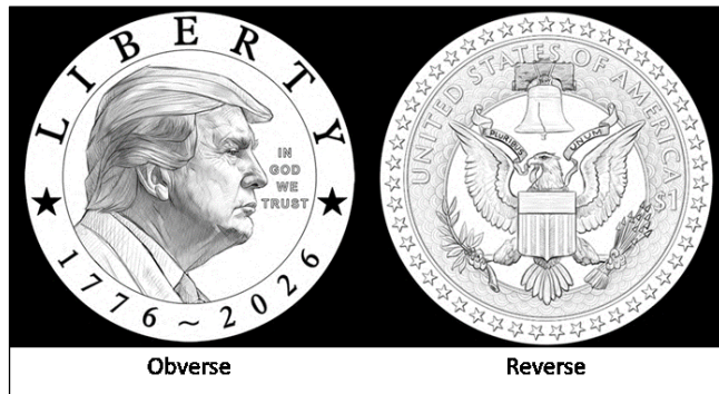
Figure 3. 2026 Dollar Coin Proposed Design