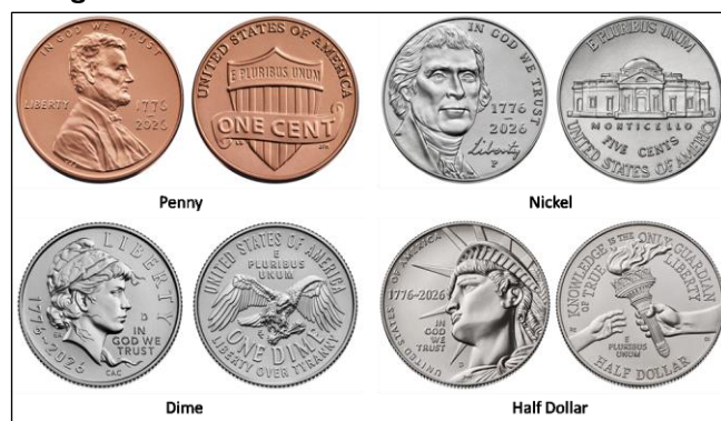
Figure 1. 2026 Penny, Nickel, Dime, and Half-Dollar Designs