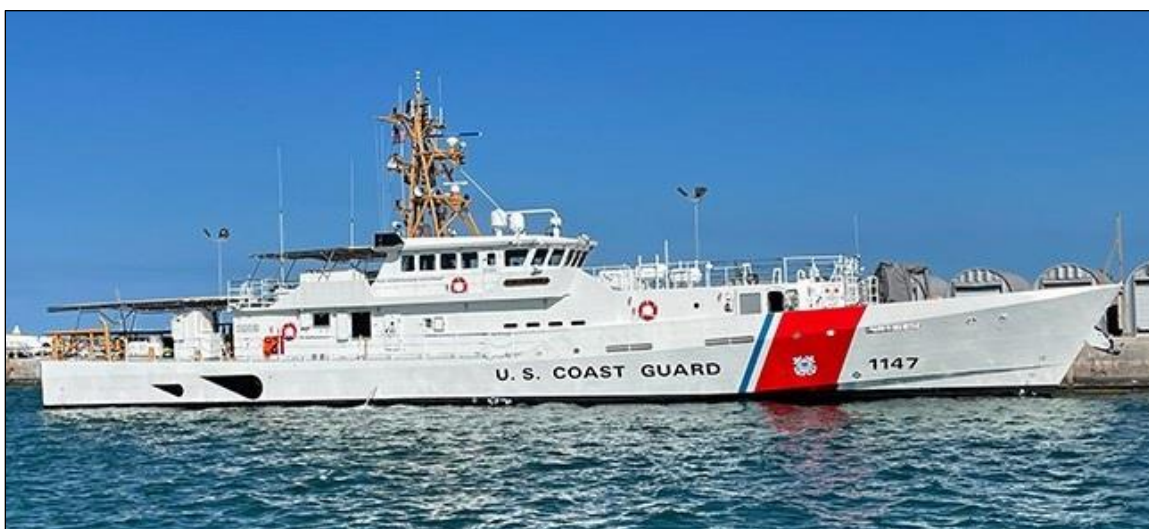
Figure 11. Fast Response Cutter