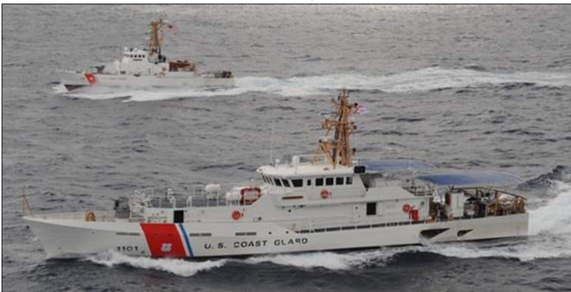
Figure 10. Fast Response Cutter With an older Island-class patrol boat behind