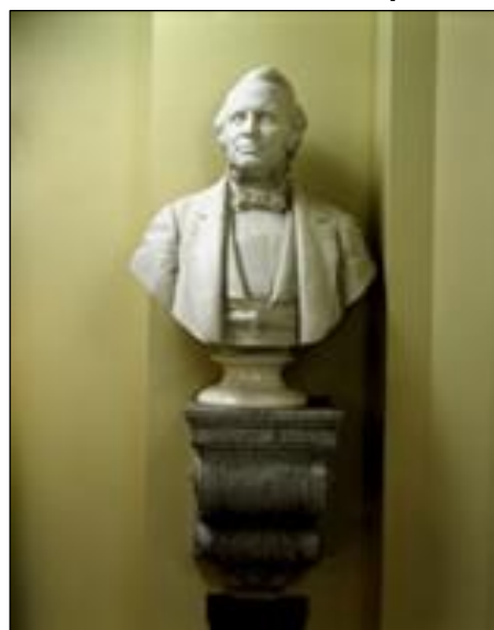
Figure 2. Bust of Vice President Henry Wilson