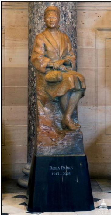
Figure 3. Rosa Parks Statue in the Capitol

In some cases, Congress has chosen to commission, or purchase, artwork to commemorate an event or the importance of an individual to the United States. For example, in the 109 th Congress (2005-2006), Congress authorized the JCL to commission a statue of Rosa Parks for placement in the Capitol (P.L. 109-116). The Rosa Parks statue was installed and dedicated in 2013. Similarly, in the 117 th Congress (2021-2022), Congress directed JCL to obtain statues of former Supreme Court Associate Justices Sandra Day O'Connor and Ruth Bader Ginsburg and directed the Architect of the Capitol to permanently install the statues in the Capitol or on Capitol Grounds (P.L. 117-111). Figure 3 shows the Rosa Parks statue located in National Statuary Hall, although it is not part of the National Statuary Hall Collection.