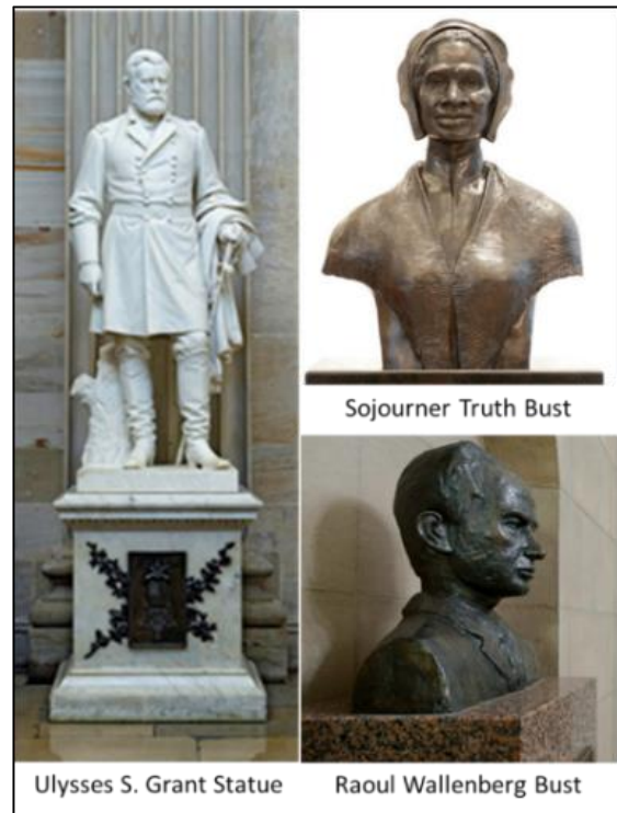
Figure 4. Examples of Statues and Busts Donated to Congress