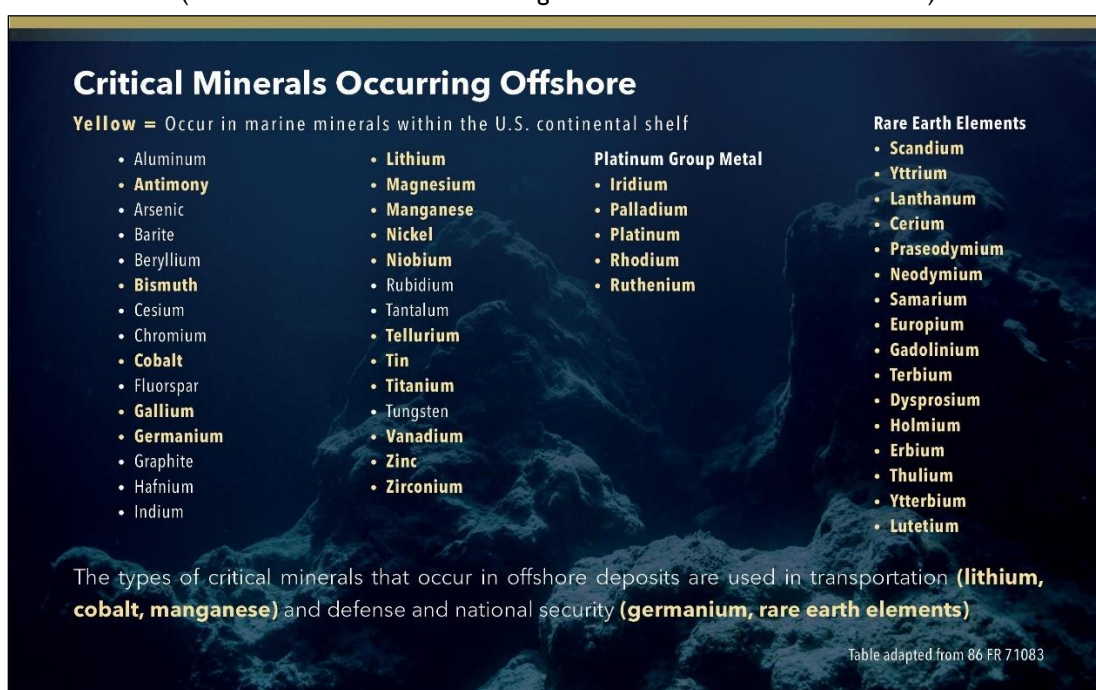
Figure 2. Critical Minerals Occurring Offshore (with subset of minerals occurring on the U.S. outer continental shelf)