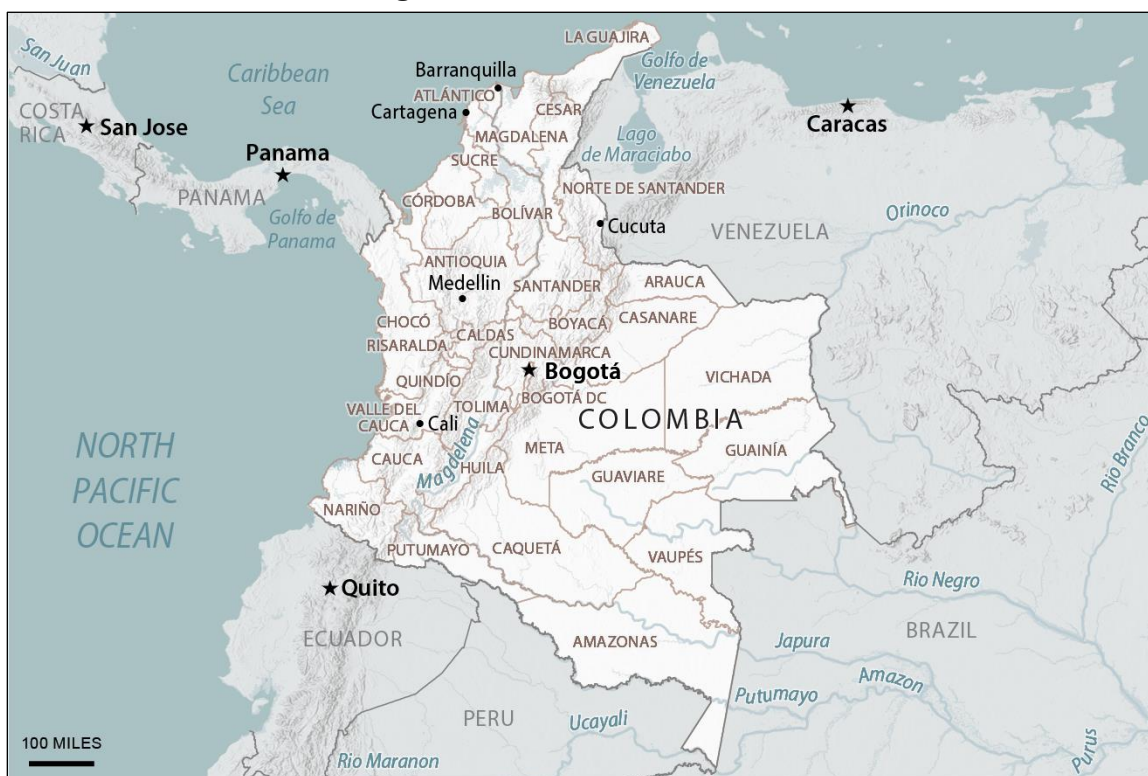
Figure I. Colombia at a Glance

Population: 53.1 million (2025, IMF estimate)