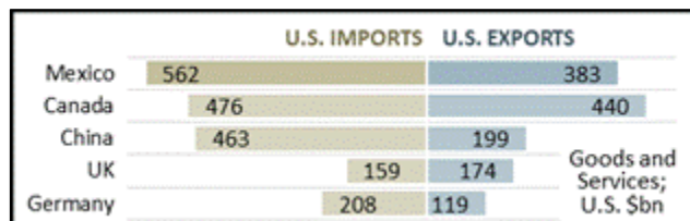
Figure 1. Top U.S. Trade Partners (2024)