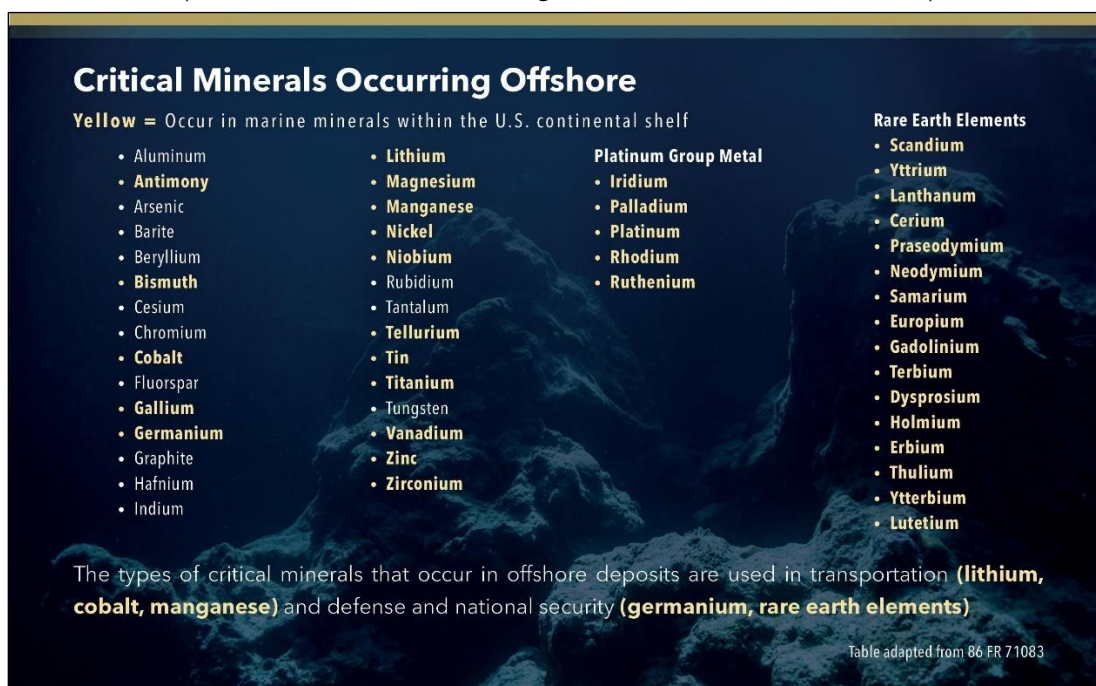
Figure 2. Critical Minerals Occurring Offshore (with subset of minerals occurring on the U.S. outer continental shelf)