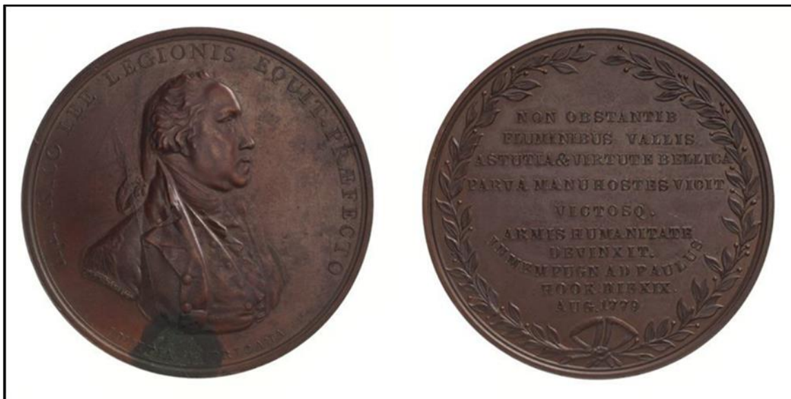
Figure I. Major Henry Lee Congressional Gold Medal

Source: Museums Victoria (AUS) “Medal—Congressional Medal, Henry Lee, United States,” Item NU 36568, at https://collections.museumsvictoria.com.au/items/1382927 .