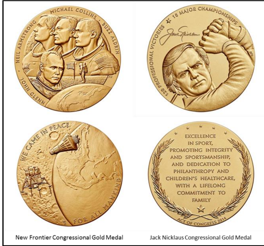
Figure 3. Recent Examples of Congressional Gold Medal Design