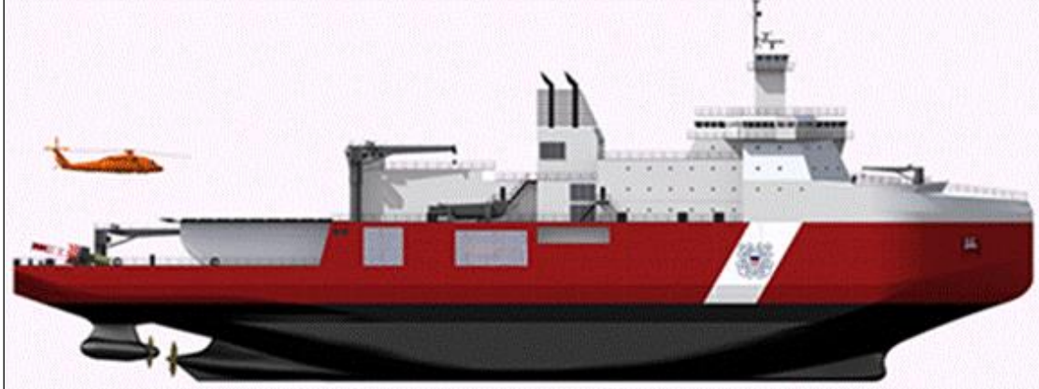
Figure 3. Rendering of Halter Marine Design for PSC