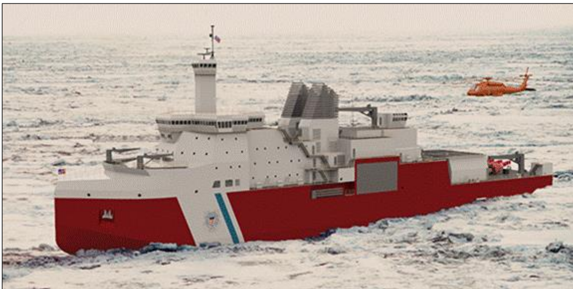
Figure 4. Rendering of Halter Marine Design for PSC

A similar image was included in Halter Marine press release, “VT Halter Marine Awarded the USCG Polar Security Cutter,” May 7, 2019, accessed November 19, 2024, at https://web.archive.org/web/20190513165621/http://www.vthm.com/public/files/20190507.pdf .