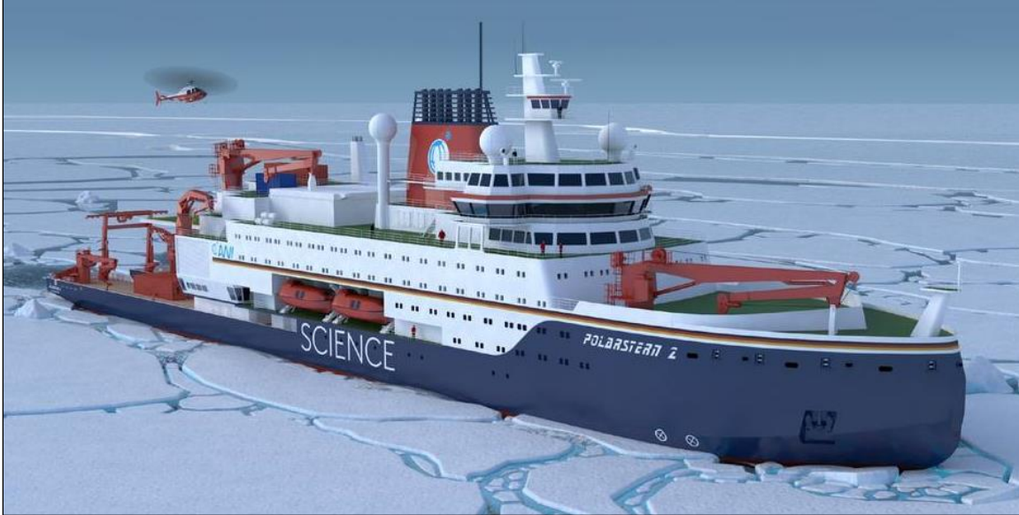
Figure 7. Rendering of 2024 Design for PolarStern II