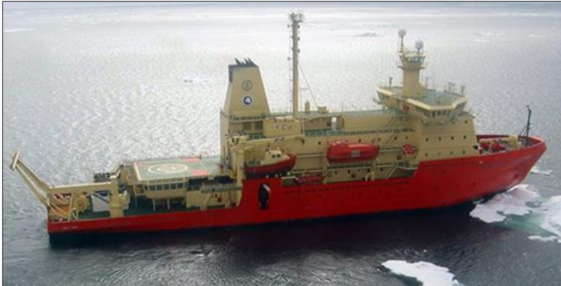
Figure A-6. Nathaniel B. Palmer

Source: Photograph accompanying Peter Rejcek, "System Study, LARISSA Takes Unique Approach for Research on Ice Shelf Ecosystem," Antarctic Sun (U.S. Antarctic Program), September 18, 2009. A caption to the photograph states "Photo Courtesy: Adam Jenkins."