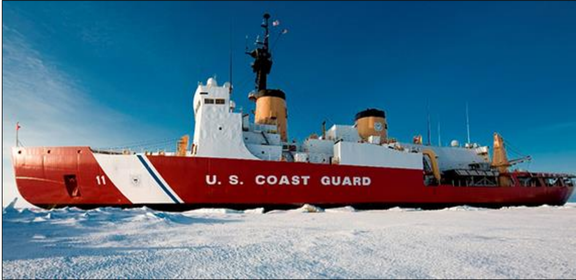
Figure A-3. Polar Sea

Source: Coast Guard photograph that was accessed April 17, 2025, at https://web.archive.org/web/20160229010100/http://www.uscg.mil/pacarea/cgcpolarsea/img/PSEApics/FullShip2.jpg . The photograph accompanies Associated Press, “Reprieve for Seattle-Based Icebreaker Polar Sea,” KOMO News, June 15, 2012, accessed April 17, 2025, at https://komonews.com/news/local/reprieve-for-seattle-based-icebreaker-polar-sea .