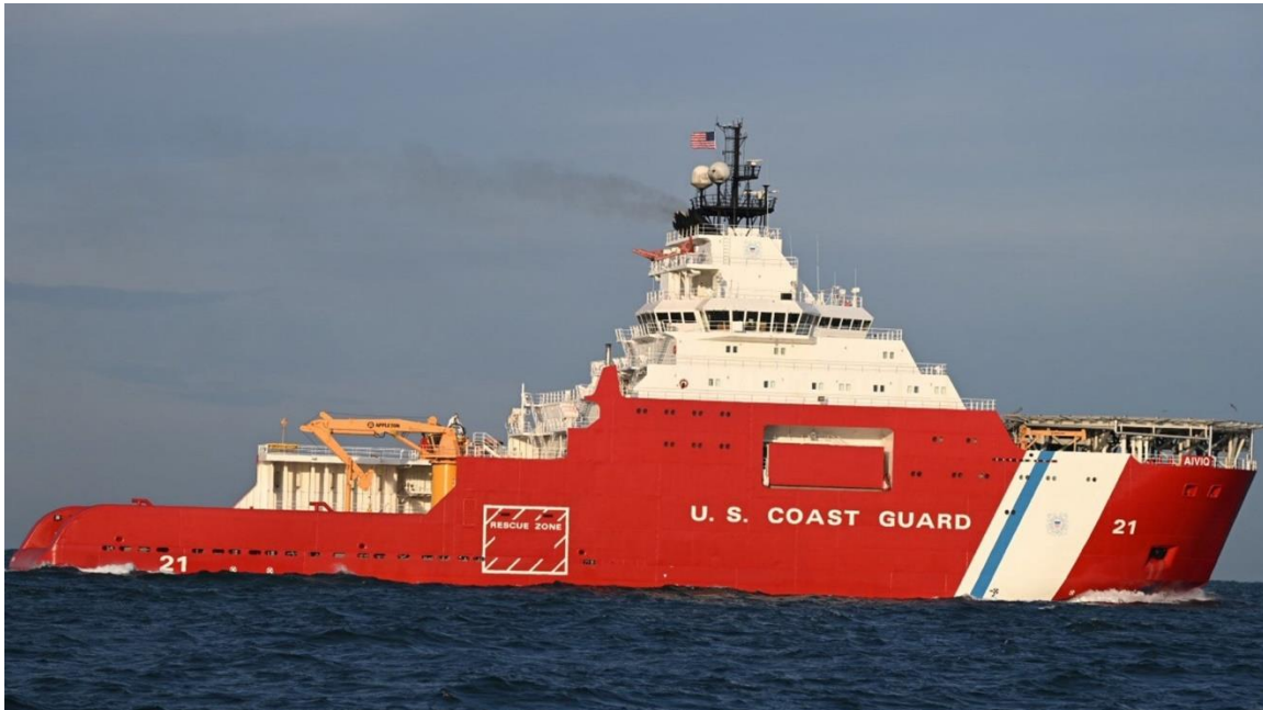
Figure A-5. Future Storis (former Aiviq )

Source: Photograph accompanying Nicholas Slayton, “The Coast Guard Is Building Up Its Arctic Fleet,” Task & Purpose, December 26, 2024. A caption to the photograph credits the photograph to the U.S. Coast Guard.