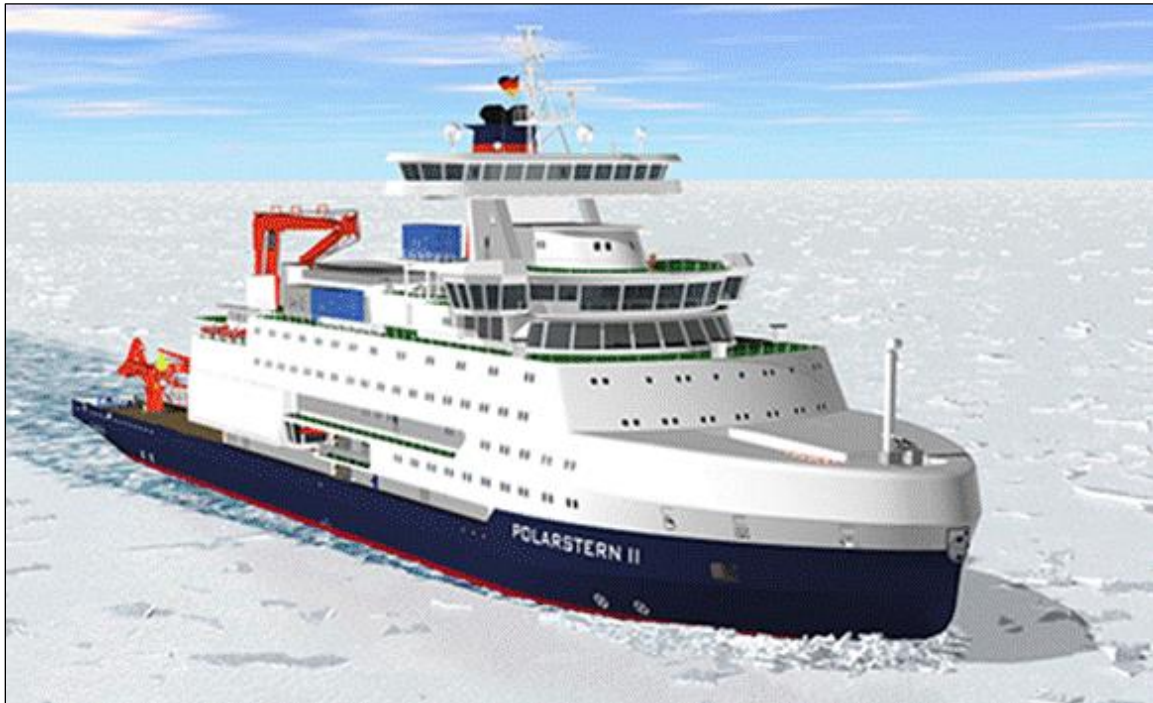
Figure 6. Rendering of 2019 SDC Concept Design for Polarstern II