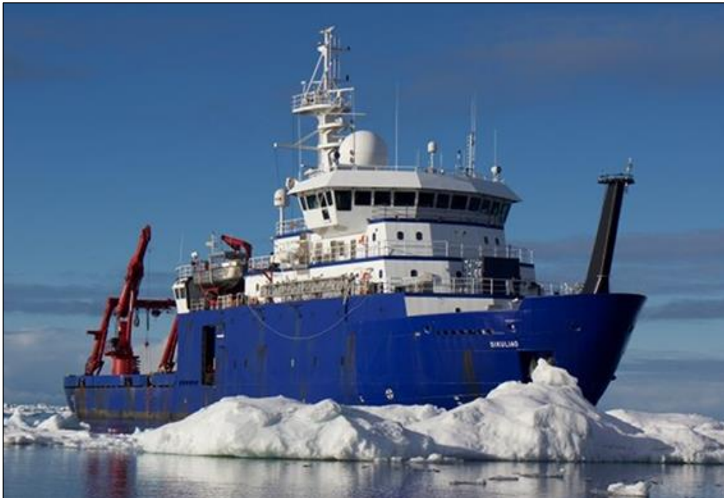
Figure A-8. Sikuliaq