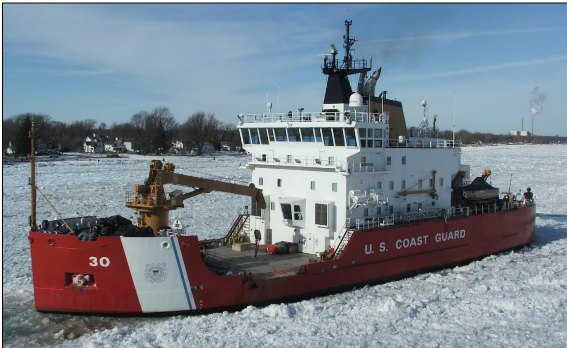
Figure 8. Great Lakes Icebreaker Mackinaw