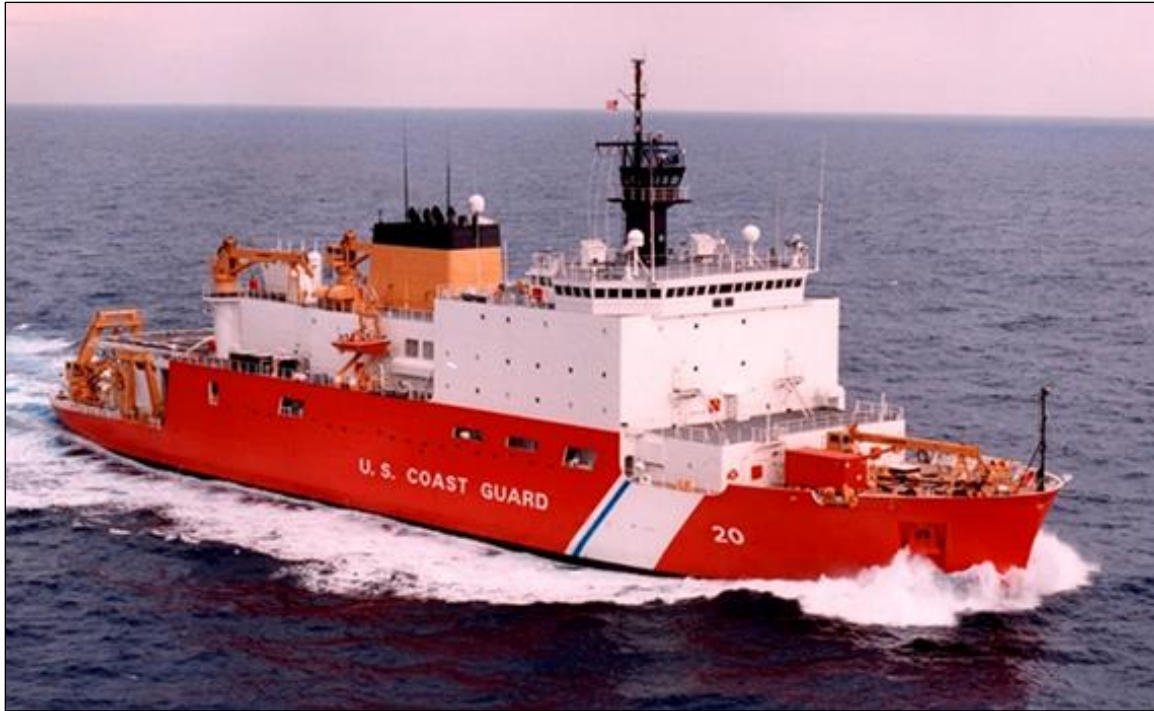
Figure A-4. Healy