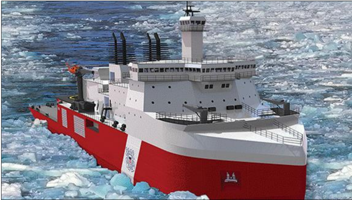
Figure 5. Rendering of Halter Marine Design for PSC