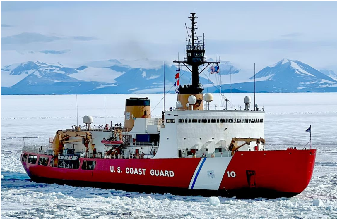
Figure A-2. Polar Star