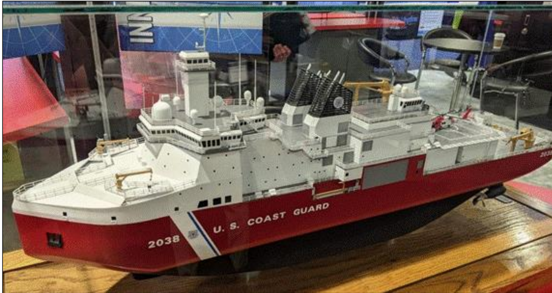
Figure 2. Model of Halter Marine Design for PSC (Photograph of model displayed at 2021 trade show)