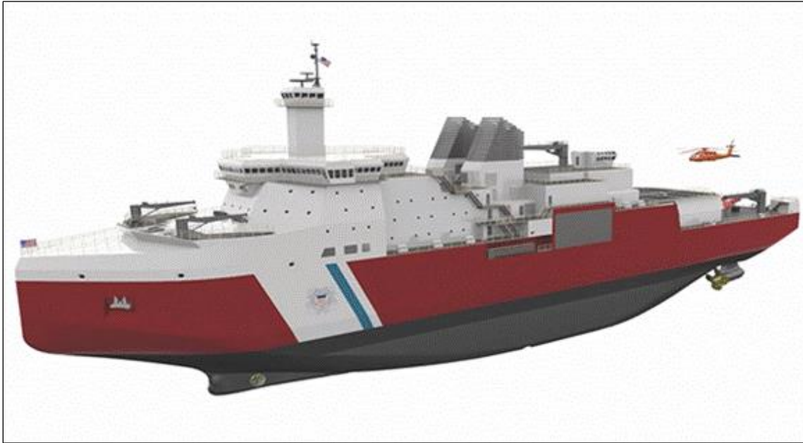
Figure 1. Rendering of Halter Marine Design for PSC