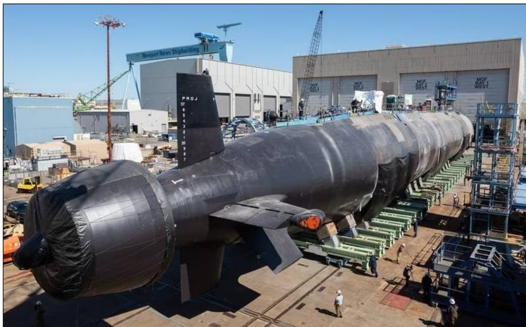
Figure 2. Virginia-Class Attack Submarine