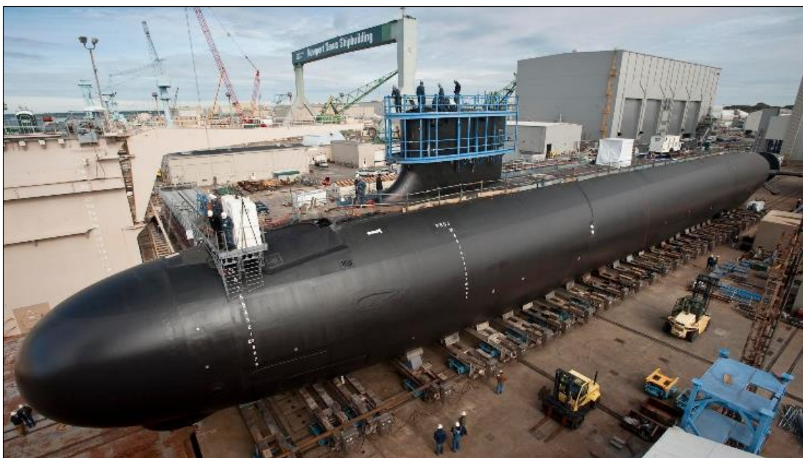
Figure 1. Virginia-Class Attack Submarine

Source: Cropped version of photograph accompanying Dan Ward, “Opinion: How Budget Pressure Prompted the Success of Virginia-Class Submarine Program,” USNI News , November 3, 2014. The caption credits the photograph to the U.S. Navy and states that it shows USS Minnesota (SSN-783) under construction in 2012.