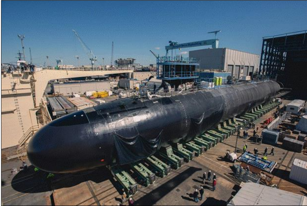
Figure 3. Virginia-Class Attack Submarine

Source: Photograph accompanying Megan Eckstein, “The US Navy Is Spending Billions to Stabilize Vendors. Will It Work?” USNI News , September 8, 2023. The caption credits the photograph to Ashley Cowan/HII and states that it shows the USS New Jersey (SSN-796) being moved at HII/NNS in April 2022.