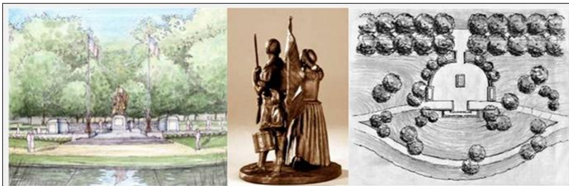
Figure 6. National Liberty Memorial Concept Design