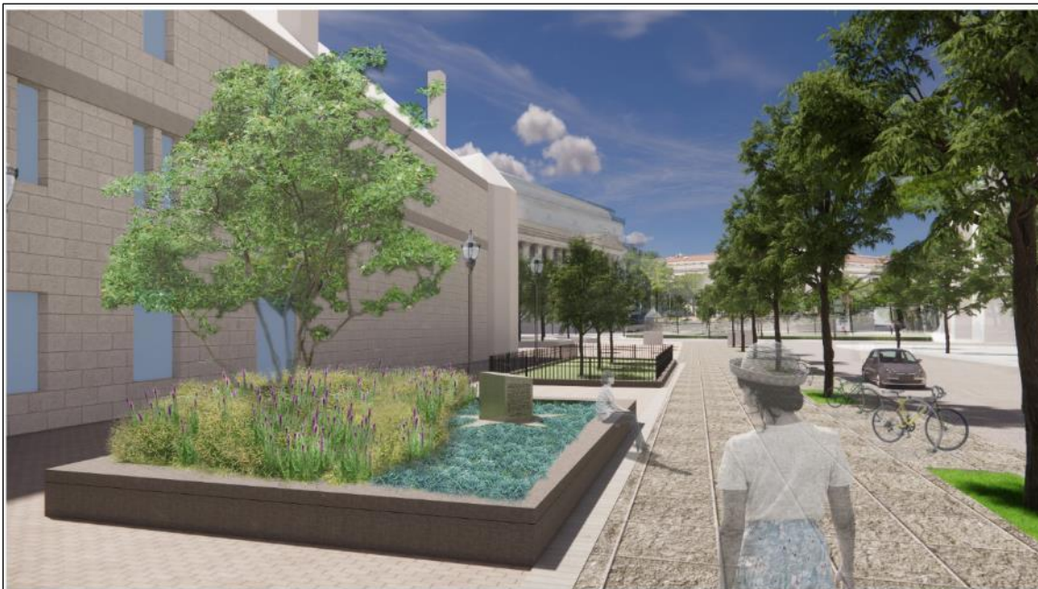
Figure 5. Texas Legation Memorial Preferred Concept Rendering