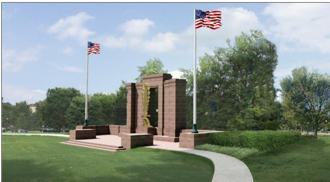
Figure 2. Second Division Memorial

Source: Second Infantry Division Association Memorial Foundation, “Second Infantry Division Memorial Modification,” CFA Submission, November 19, 2020, p. 21, at https://www.cfa.gov/system/files/meeting-materials/CFA-19NOV20-2-Second_Division_Memorial_%28pres%29.pdf .