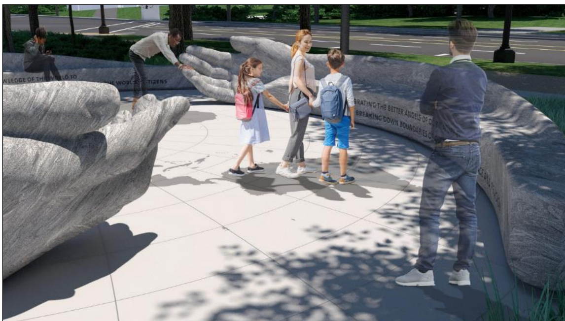
Figure 3. Peace Corps Memorial Concept Design