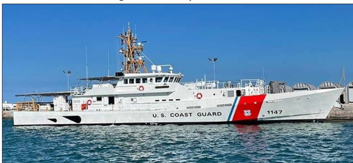
Figure 11. Fast Response Cutter