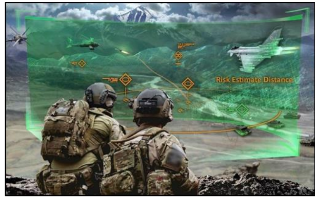
Figure 2. Illustrative Battlefield Use of XR