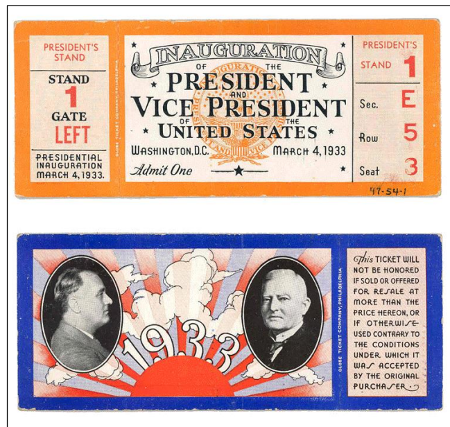
Figure 2. 1933 Inaugural Ceremony Ticket