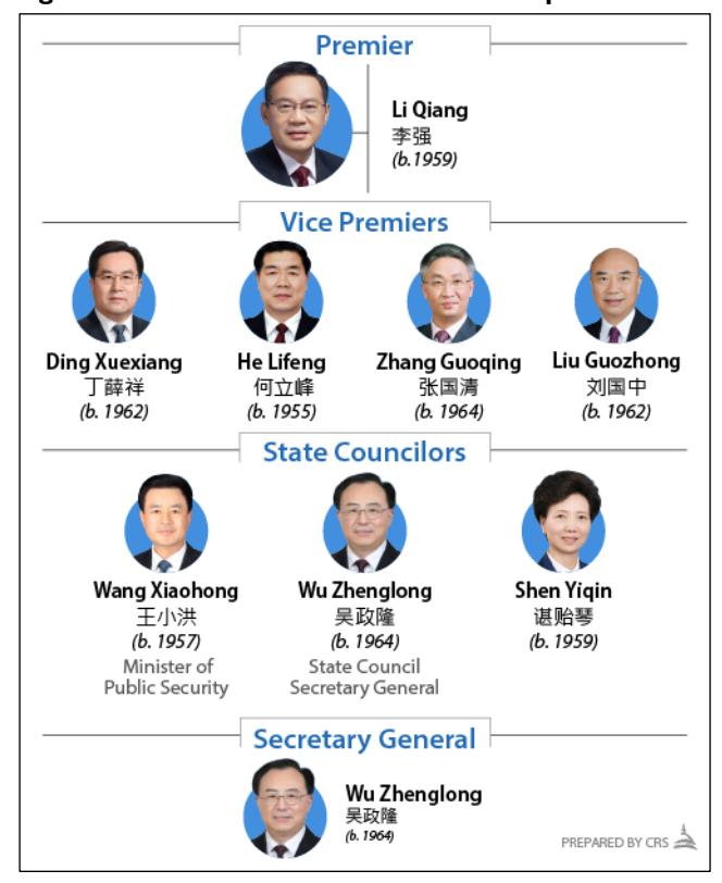
Figure 2. China's State Council Leadership

Current as of January 1, 2025.