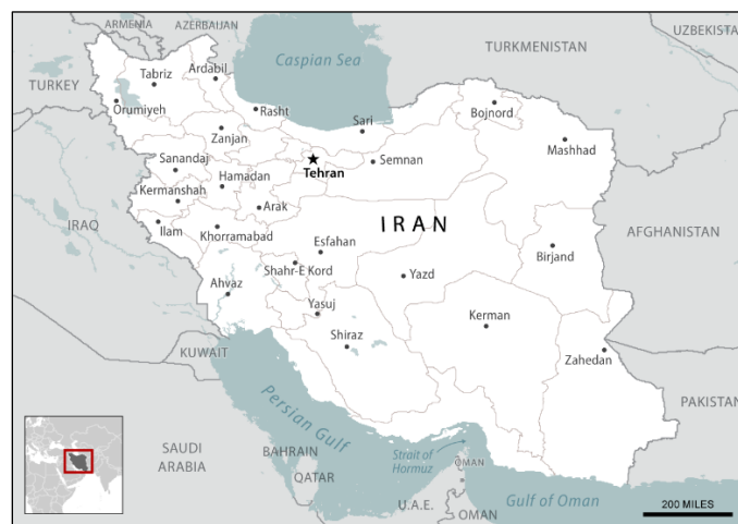
Figure 1. Iran at a Glance

The Islamic Republic of Iran, the second-largest country in the Middle East by size (after Saudi Arabia) and population (after Egypt), has for decades played an assertive, and by many accounts destabilizing, role in the region and beyond. Iran also derives influence from its oil reserves (the world's fourth largest) and its status as the world's most populous Shia Muslim country.