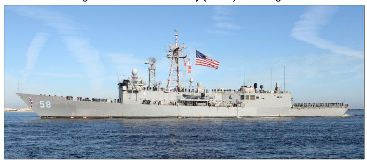
Figure I. Oliver Hazard Perry (FFG-7) Class Frigate

ships authorized by Congress in 1794—the six heavy frigates United States , Constellation , Constitution , Chesapeake , Congress , and President . FFG(X)s henceforth became known as Constellation (FFG-62) class ships.