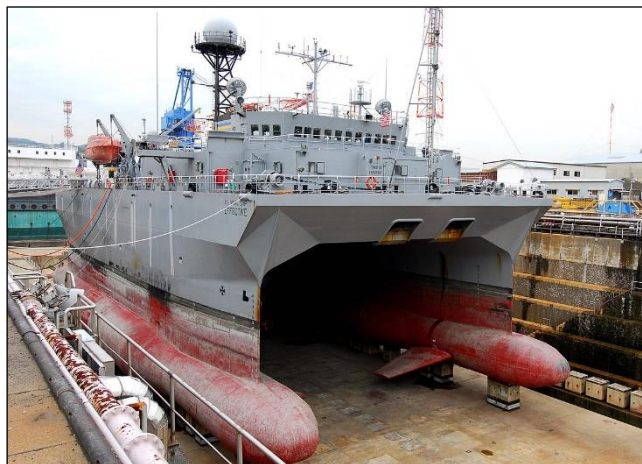
Figure 2. USNS Effective (TAGOS-21) in Dry Dock