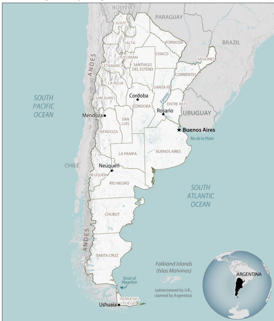
Figure I. Map of Argentina with Provinces and Selected Cities