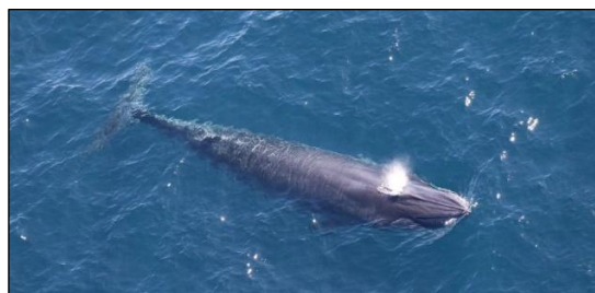
Figure 1. Rice's Whale