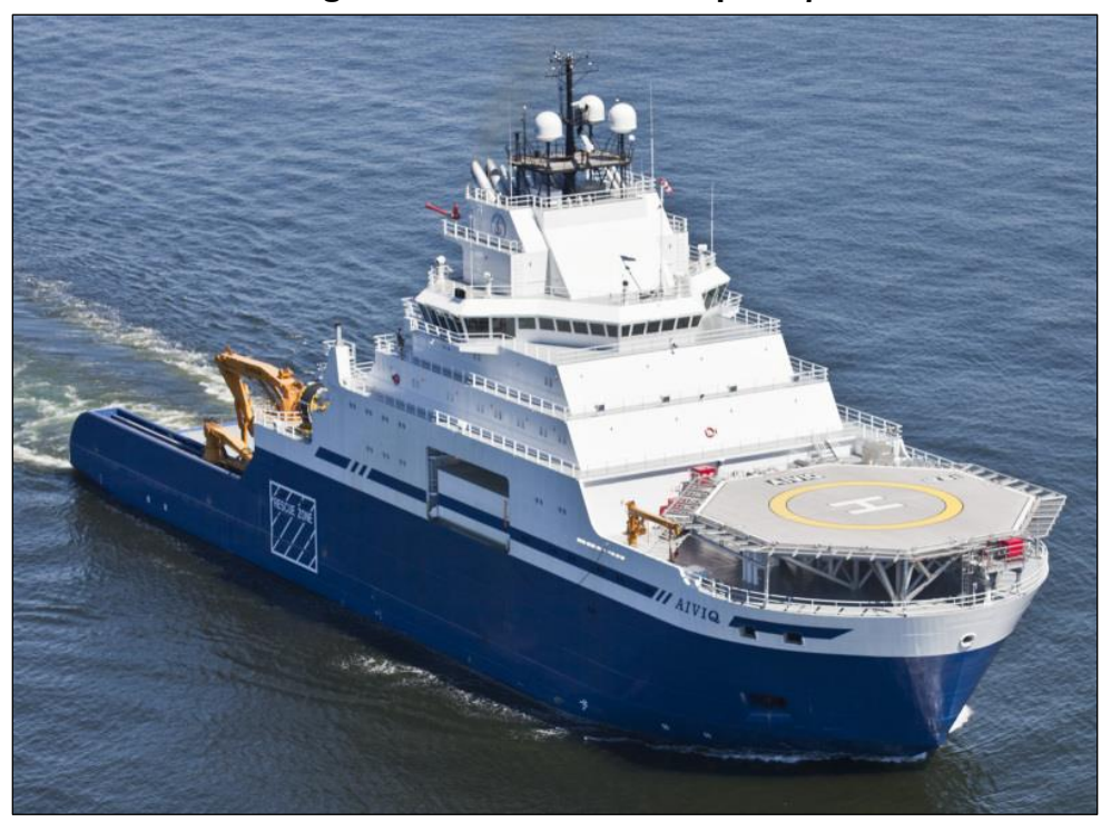
Figure A-7. Commercial Ship Aiviq