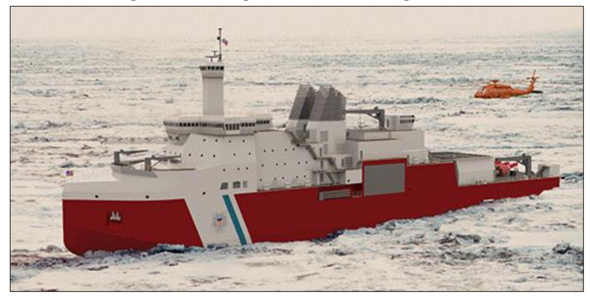
Figure 4. Rendering of Halter Marine Design for PSC

An April 25, 2019, press report states that "the Coast Guard and Navy said VT Halter Marine's winning design for the new PSC "meets or exceeds all threshold requirements' in the ship specification" for the PSC program.<sup>28</sup>