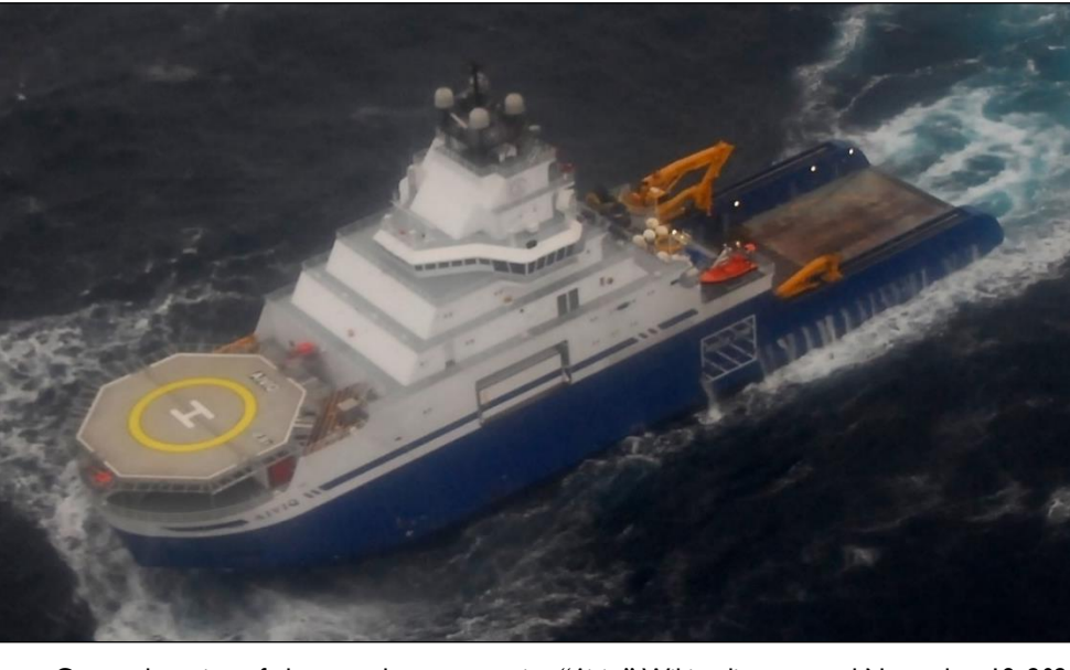
Figure A-8. Commercial Ship Aiviq