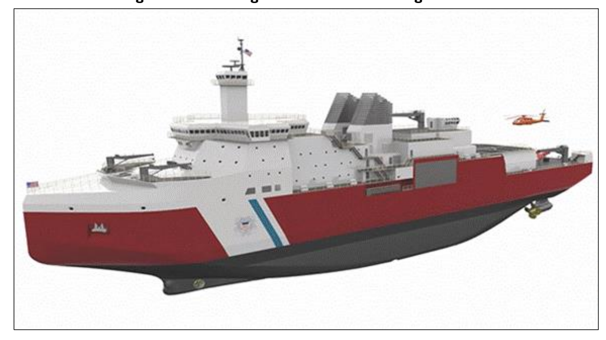
Figure 1. Rendering of Halter Marine Design for PSC

Figure 1, Figure 2, Figure 3, Figure 4, and Figure 5 show renderings and a photograph of Halter Marine's design for the PSC.