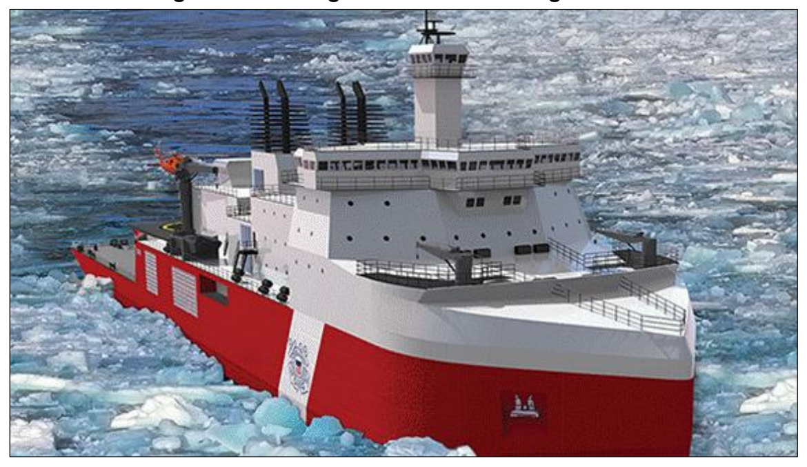
Figure 5. Rendering of Halter Marine Design for PSC

HVAC system. The program is scheduled to bring an additional 900 skilled craftsman and staff to the Mississippi-based shipyard.<sup>30</sup>