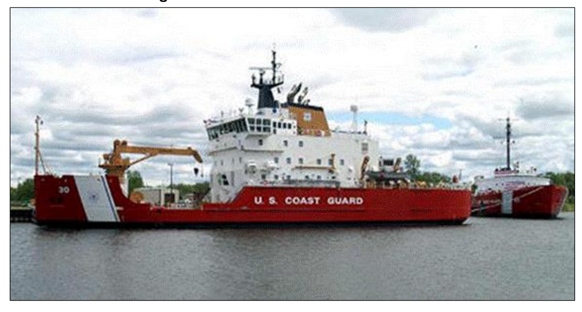
Figure 7. Great Lakes Icebreaker Mackinaw