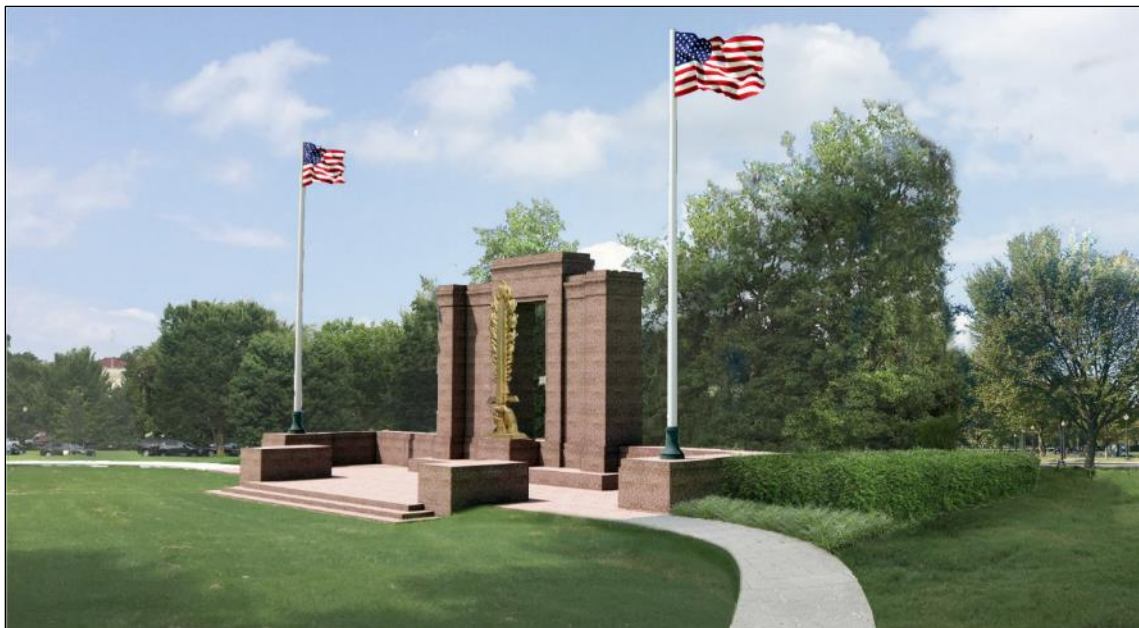
Figure 2. Second Division Memorial

Source: Second Infantry Division Association Memorial Foundation, “Second Infantry Division Memorial Modification,” CFA Submission, November 19, 2020, p. 21, at https://www.cfa.gov/system/files/meeting-materials/CFA-19NOV20-2-Second_Division_Memorial_%28pres%29.pdf .