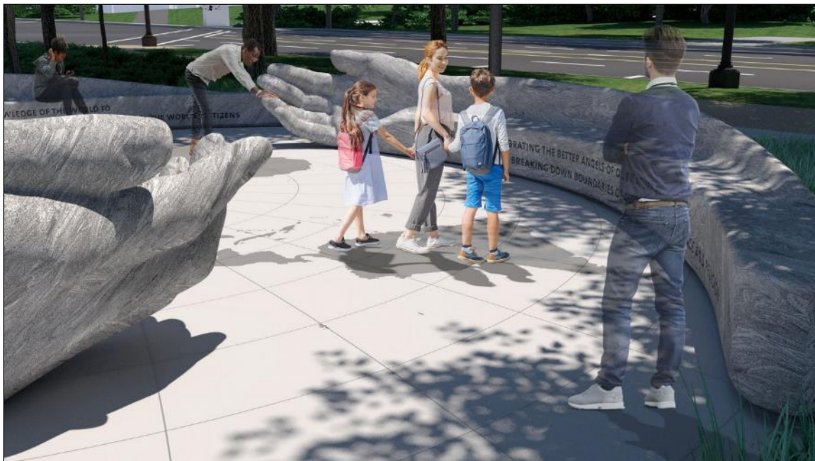
Figure 3. Peace Corps Memorial Concept Design

Source: Peace Corps Commemorative Foundation, “View of threshold between benches.”