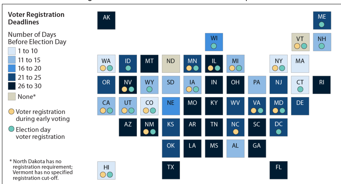
Figure is interactive in the HTML version of this report.