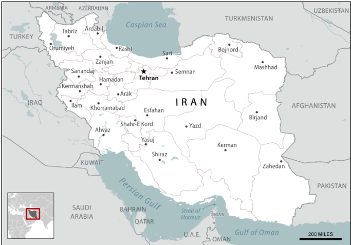
Figure 1. Iran at a Glance

The Islamic Republic of Iran, the second-largest country in the Middle East by size (after Saudi Arabia) and population (after Egypt), has for decades played an assertive, and by many accounts destabilizing, role in the region and beyond. Iran’s influence stems from its oil reserves (the world’s fourth largest), its status as the world’s most populous Shia Muslim country, and its active support for political and armed groups (including several U.S.-designated terrorist organizations) throughout the Middle East.