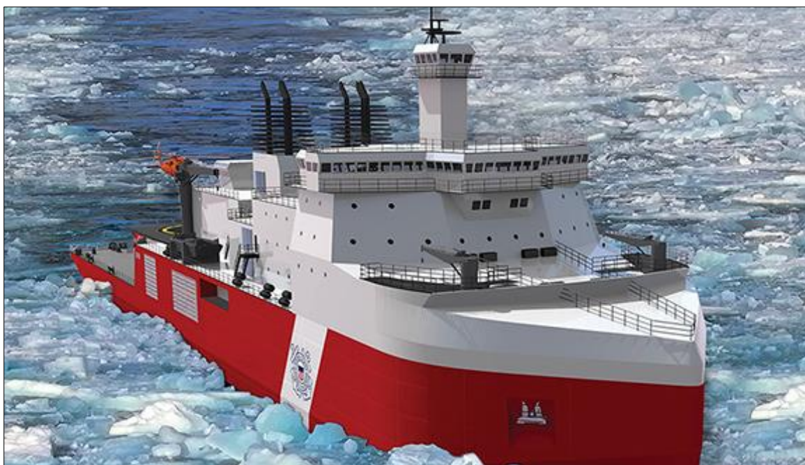
Figure 5. Rendering of Halter Marine Design for PSC