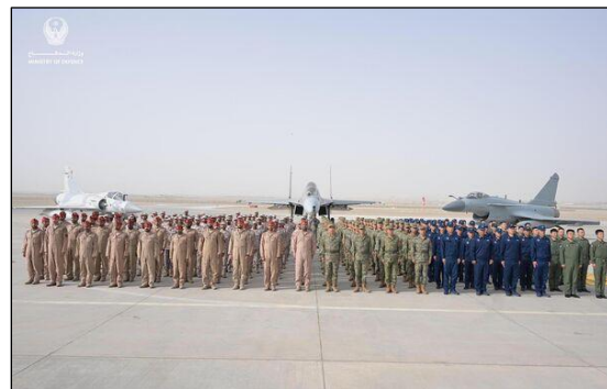
Figure 4. UAE-China Air Exercise 2024

At times, the UAE has acted as an interlocutor between the United States and its rivals. In the case of Russia, the UAE (and Saudi Arabia) claimed to have played a successful role in mediating the release of American citizen and professional basketball player Brittney Griner. 82 Upon her release by Russian authorities in a prisoner swap, a private Emirati plane flew Griner from Moscow to Bateen Airport (an executive airport) in Abu Dhabi, where she was taken safely into