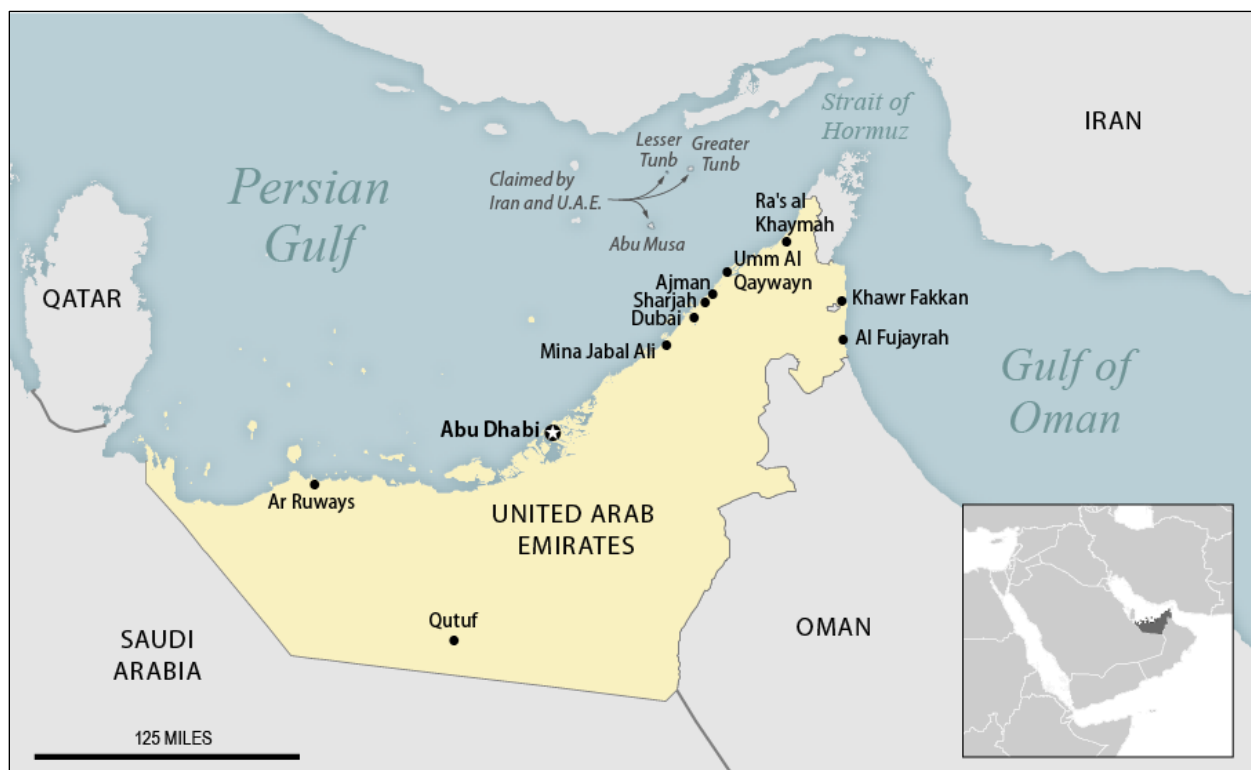
Figure 1. UAE at a Glance

The United Arab Emirates (UAE) is a federation of seven emirates (principalities): Abu Dhabi, the oil-rich federation capital; Dubai, the wealthiest city in the Middle East; and the five smaller and less wealthy emirates of Sharjah, Ajman, Fujairah, Umm al Qaywayn, and Ra's al Khaymah. Since the late 1960s, the UAE's population has increased from 180,000 to over 10 million. Dubai, with a population of over 3 million, is the largest city and home to multiple expatriate communities (see Figure 1 ). Expatriates make up nearly 90% of the total UAE population.