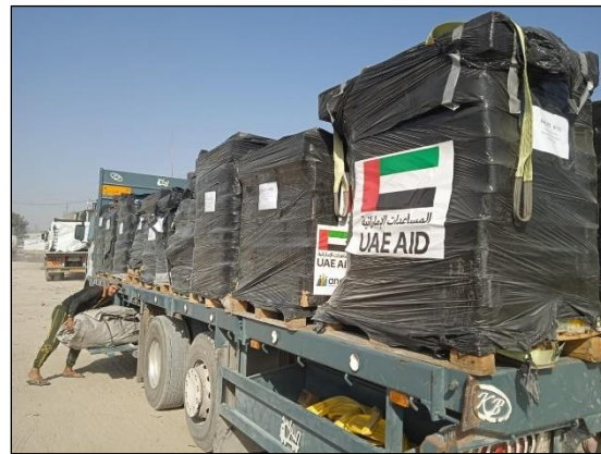
Figure 6. UAE Aid for Gaza