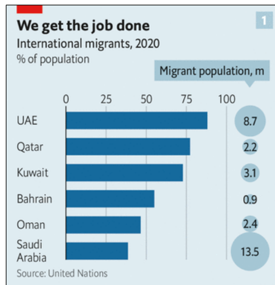
Figure 3. Migrant Population by Percentage in the GCC

M means millions.