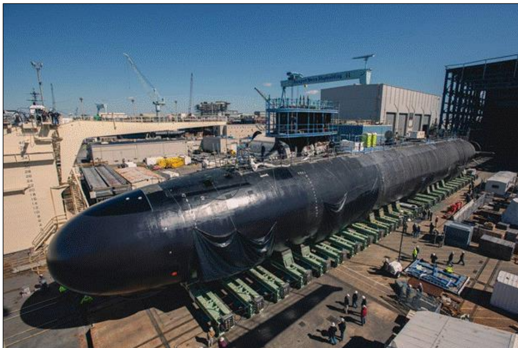
Figure 3. Virginia-Class Attack Submarine

Source: Photograph accompanying Megan Eckstein, “The US Navy Is Spending Billions to Stabilize Vendors. Will It Work?” USNI News , September 8, 2023. The caption credits the photograph to Ashley Cowan/HII and states that it shows the USS New Jersey (SSN-796) being moved at HII/NNS in April 2022.