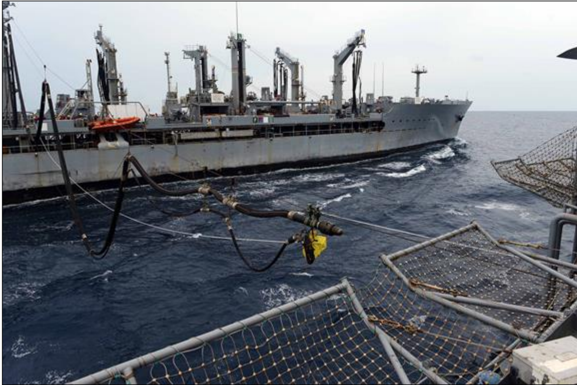
Figure 1. Fleet Oiler Conducting an UNREP

The Navy states that the photo is dated October 24, 2013, and shows the oiler Tippecanoe (TAO-199) extending its fuel probe to the Aegis cruiser USS Antietam (CG-54), a part of the George Washington (CVN-73) Carrier Strike Group, in the South China Sea.