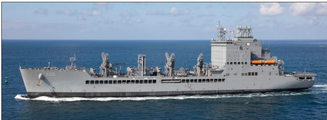
Figure 6. John Lewis (TAO-205)

Source: Cropped version of photograph accompanying Team Ships Public Affairs, “USNS John Lewis Conducts Builder’s Trials,” Naval Sea Systems Command, February 7, 2022.