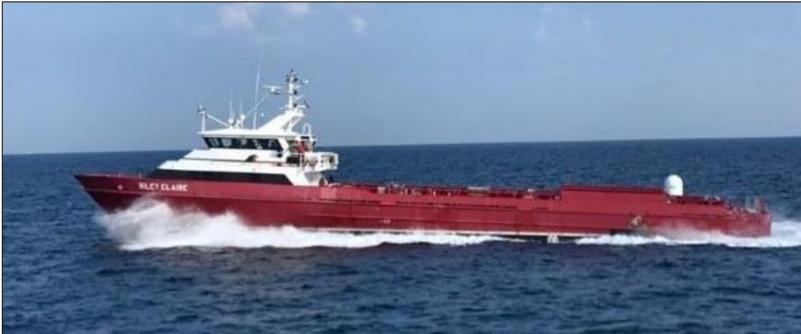
Figure 5. LUSV Prototype