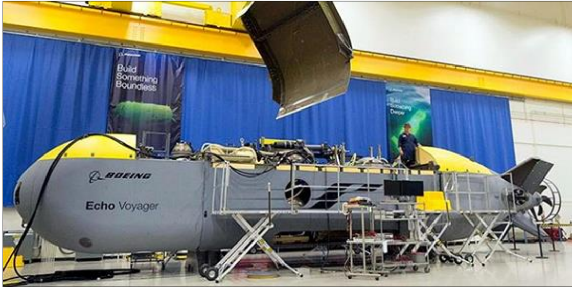
Figure 10. Boeing Echo Voyager UUV