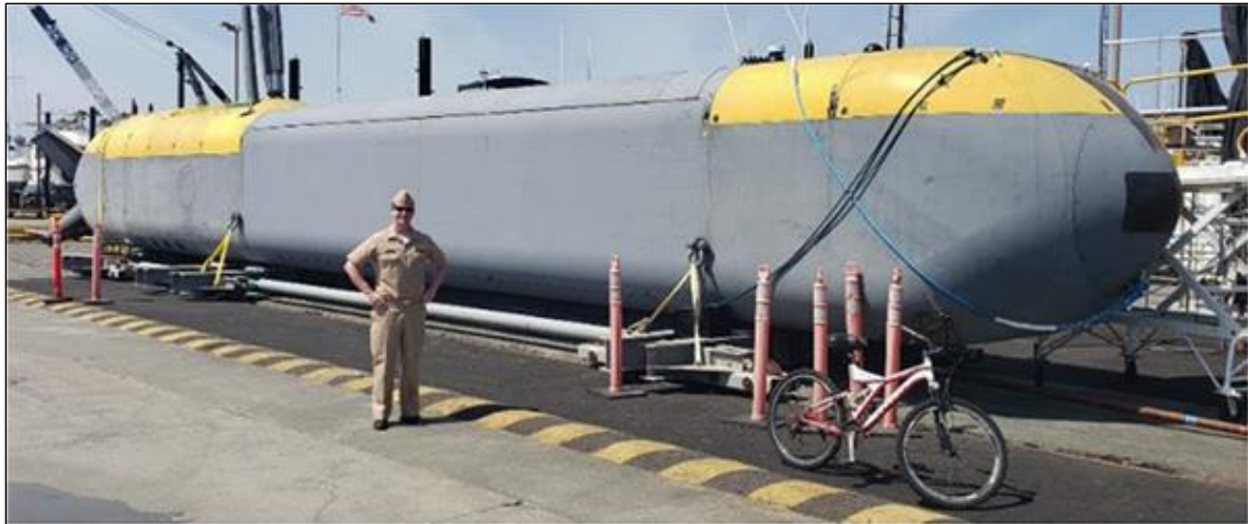
Figure 11. Boeing Echo Voyager UUV