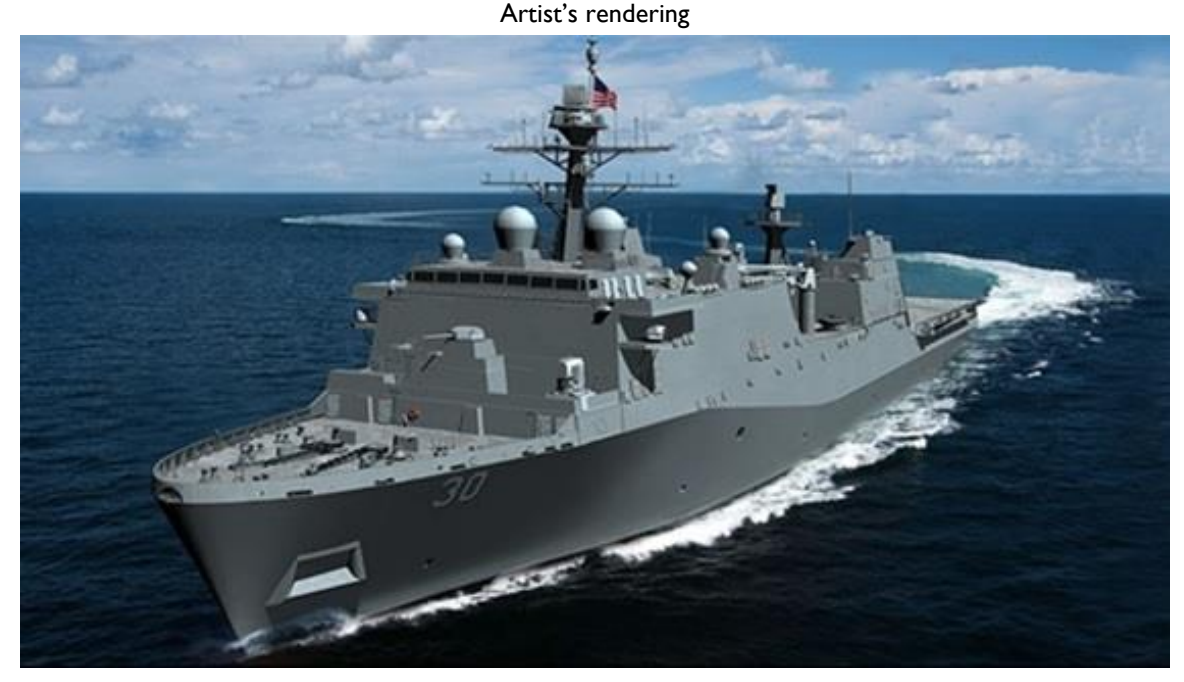
Figure 2. LPD-17 Flight II Design