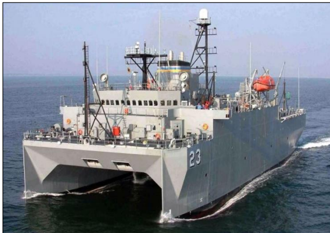
Figure 1. USNS Impeccable (TAGOS-23)