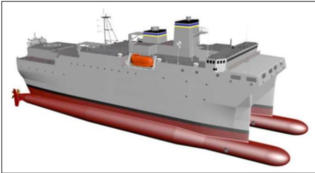
Figure 4. Notional Navy Design for TAGOS-25

Source: Artist's rendering accompanying press released entitled "Halter Marine Secures Contract for Industrial Studies for T-AGOS Program," Halter Marine, July 20, 2020.