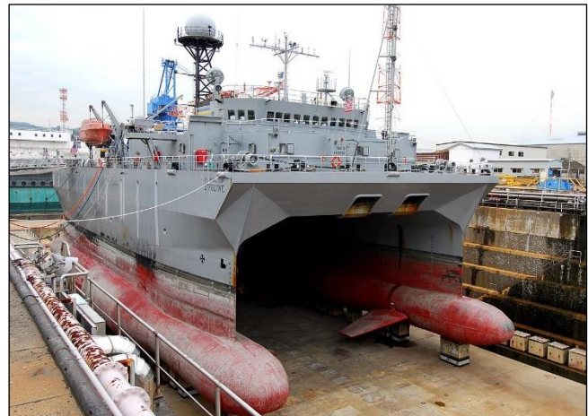
Figure 2. USNS Effective (TAGOS-21) in Dry Dock