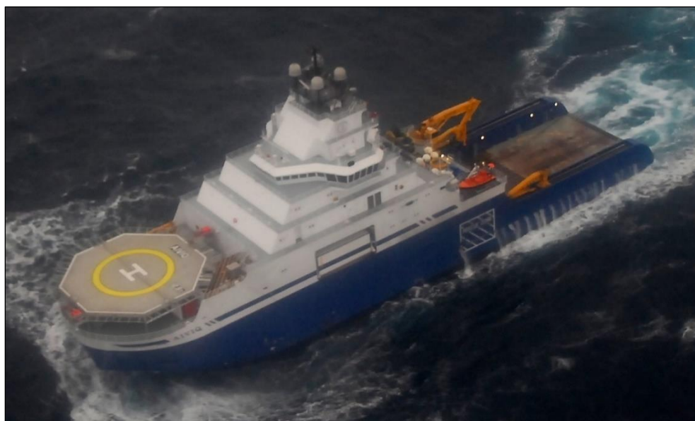
Figure A-8. Commercial Ship Aiviq