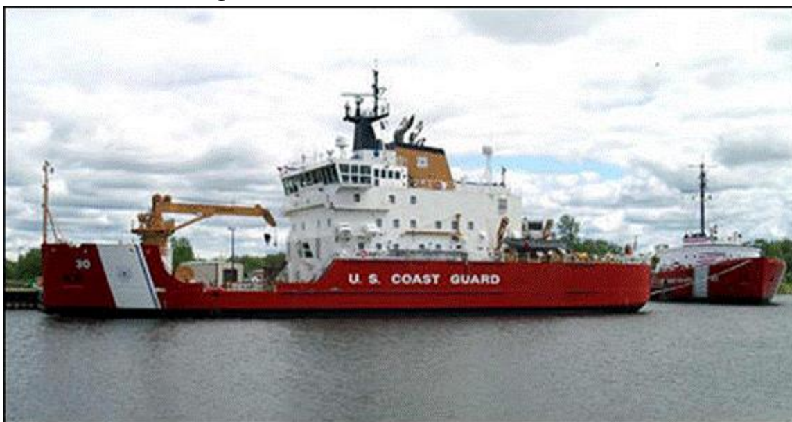
Figure 7. Great Lakes Icebreaker Mackinaw