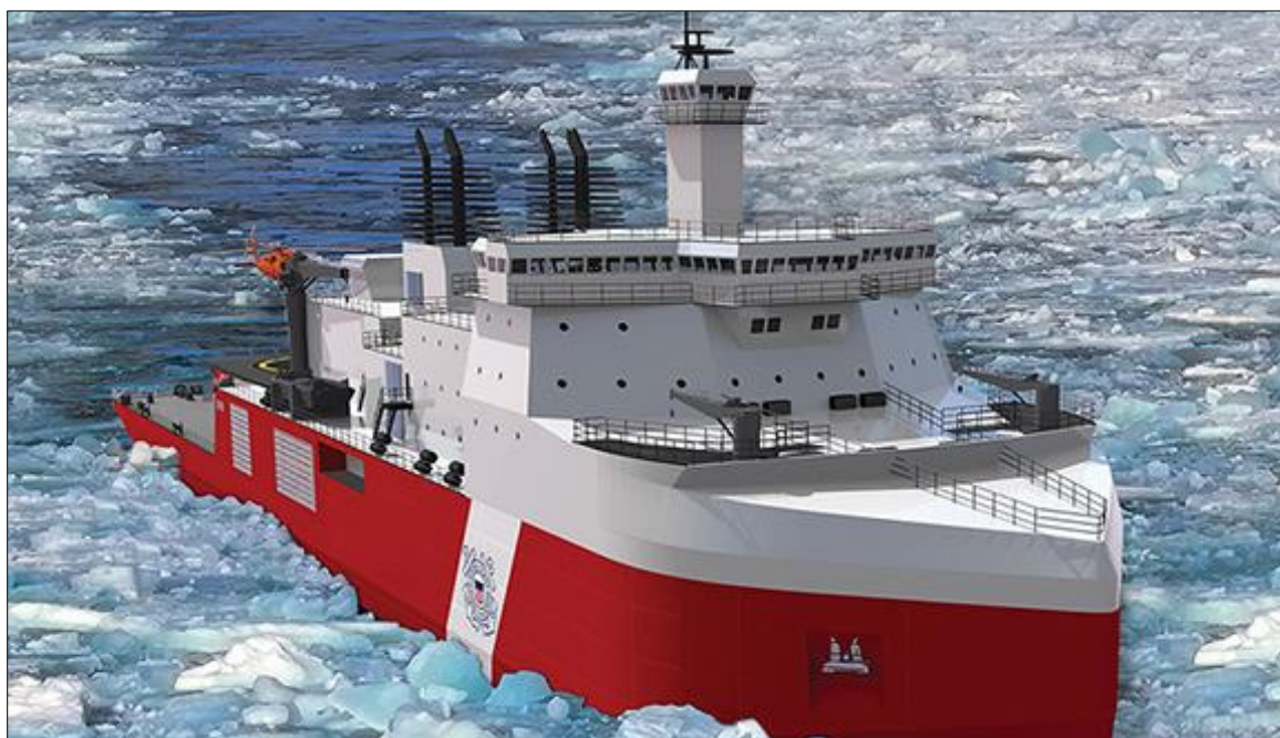
Figure 5. Rendering of Halter Marine Design for PSC