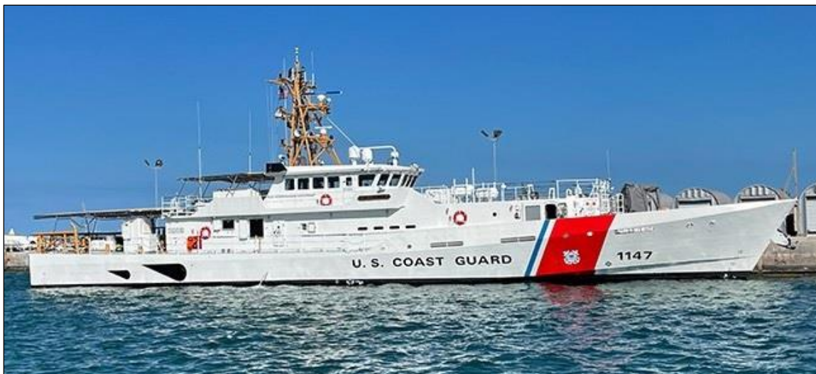
Figure 11. Fast Response Cutter