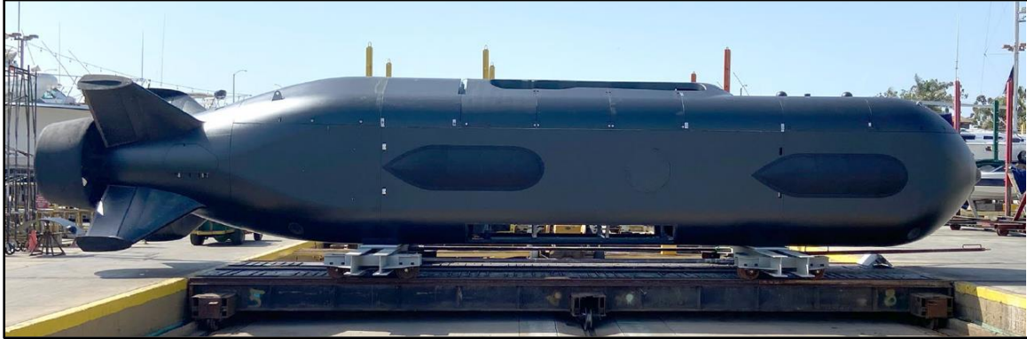
Figure 8. XLUUV (Orca)