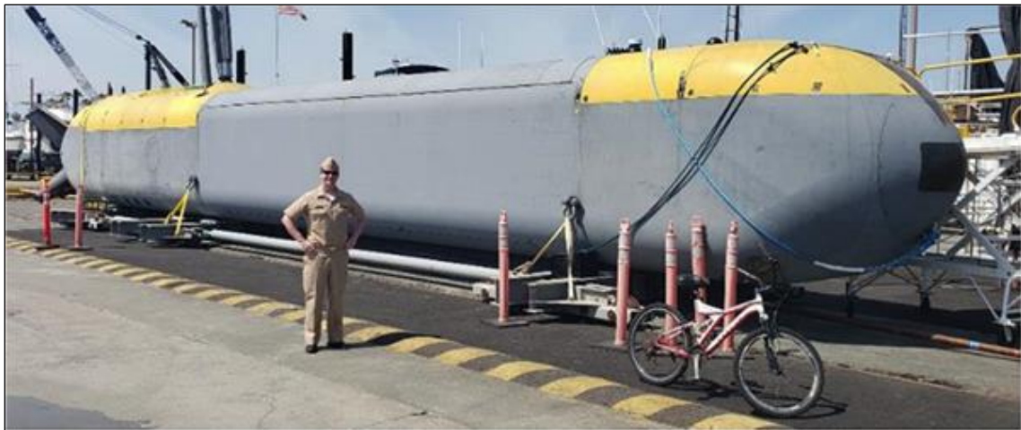
Figure 11. Boeing Echo Voyager UUV