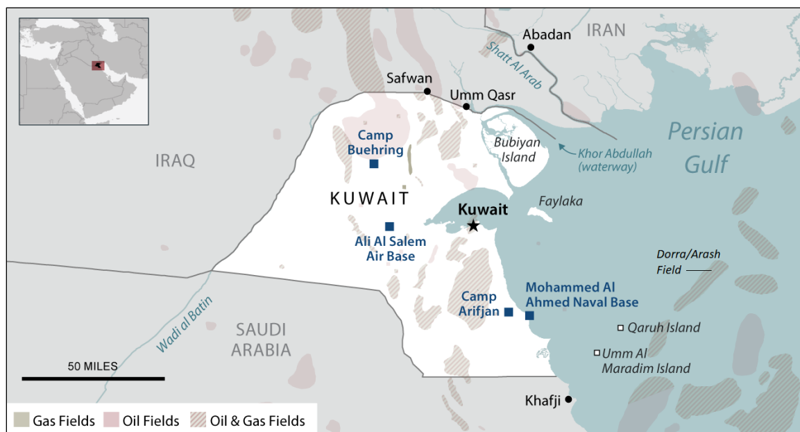
Figure 1. Map of Kuwait