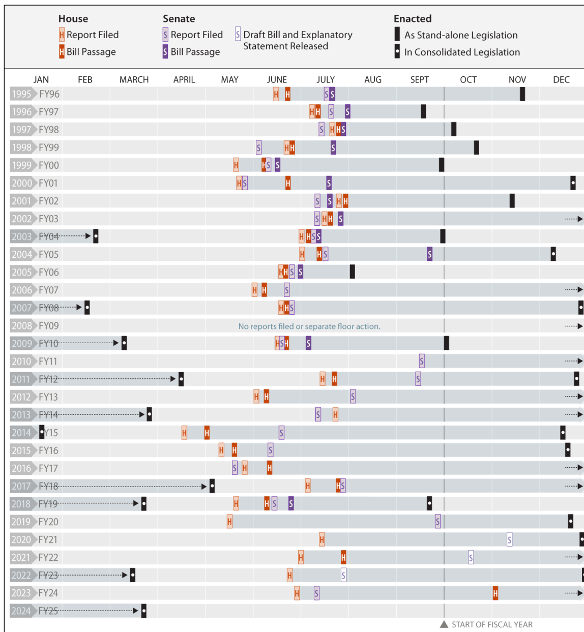
Figure is interactive in the HTML version of this report.