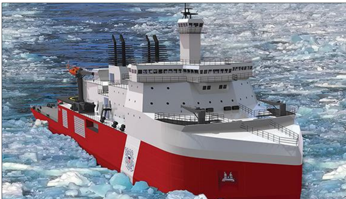
Figure 5. Rendering of Halter Marine Design for PSC