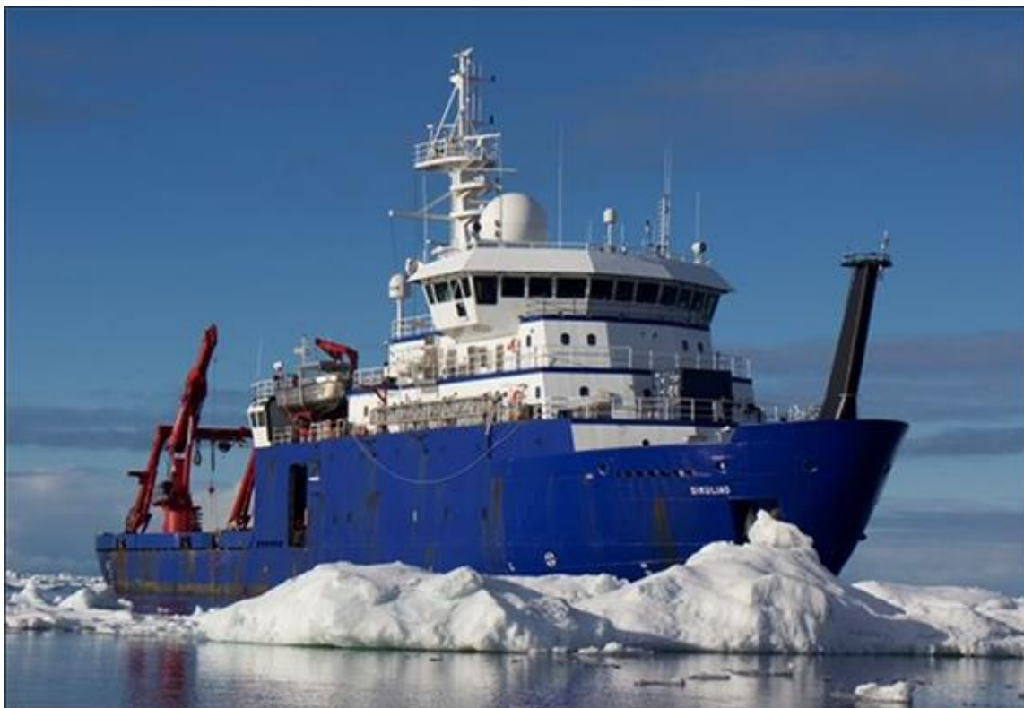
Figure A-6. Sikuliaq