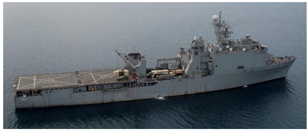
Figure 1. LSD-41/49 Class Ship

planning a 36-ship amphibious force that included 12 LSD-41/49 class ships. LSD-41/49 class ships have an expected service life of 40 years. The Navy began retiring LSD-41/49 class ships in 2021.