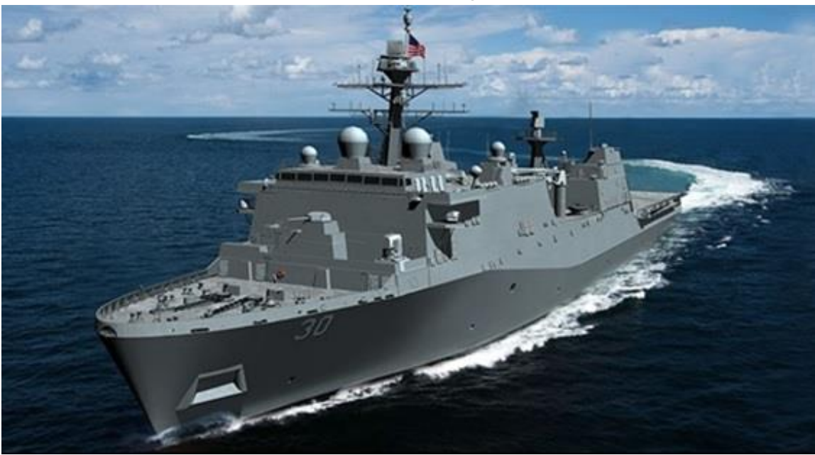
Figure 2. LPD-17 Flight II Design Artist's rendering