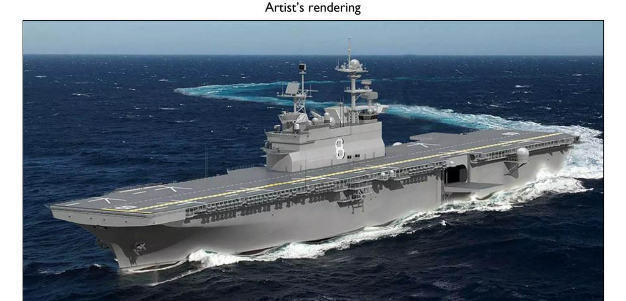
Figure 3. LHA-8 Amphibious Assault Ship

Source: Rendering accompanying Tyler Rogoway, "The Next America Class Amphibious Assault Ship Will Almost Be In a Class of its Own," The Drive , April 17, 2018. A note on the photo credits the photo to HII.