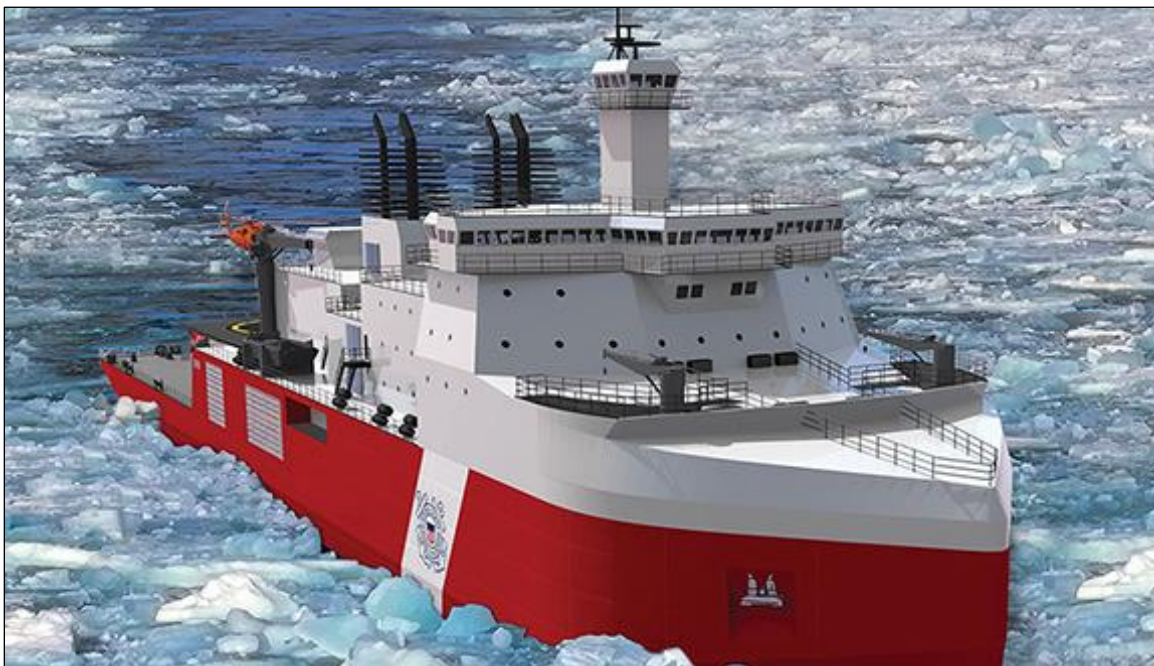
Figure 5. Rendering of Halter Marine Design for PSC