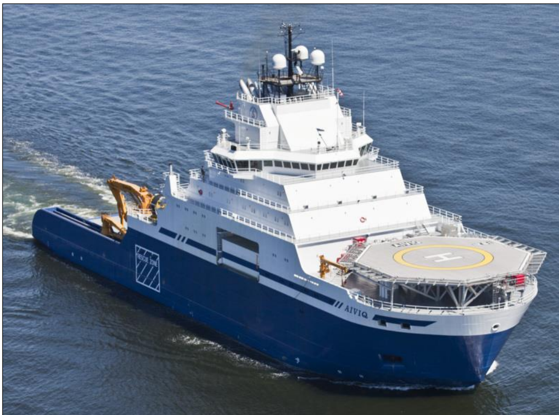
Figure A-7. Commercial Ship Aiviq