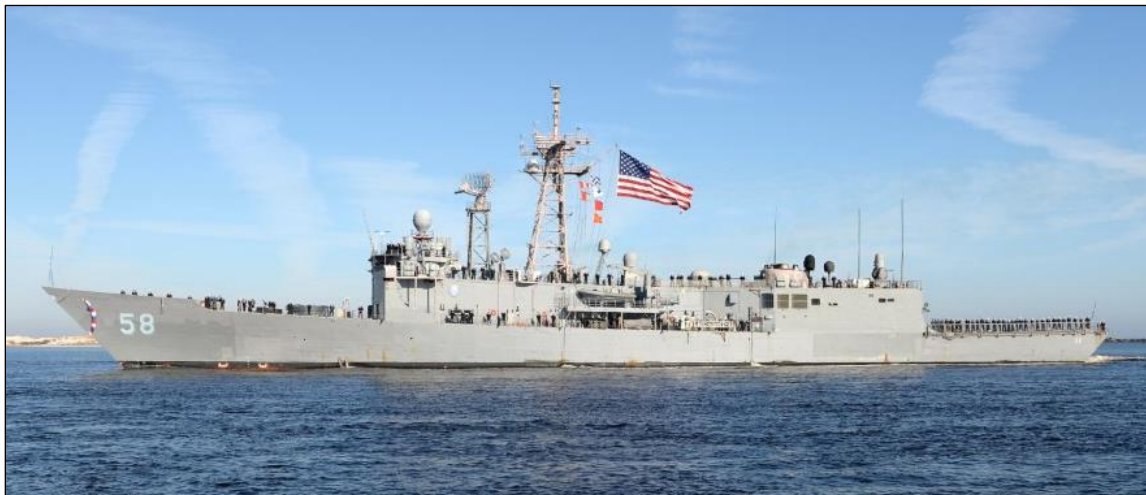
Figure 1. Oliver Hazard Perry (FFG-7) Class Frigate