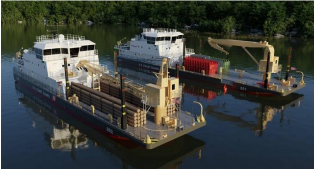
Figure 1. Notional Rendering of WLIC and WLR