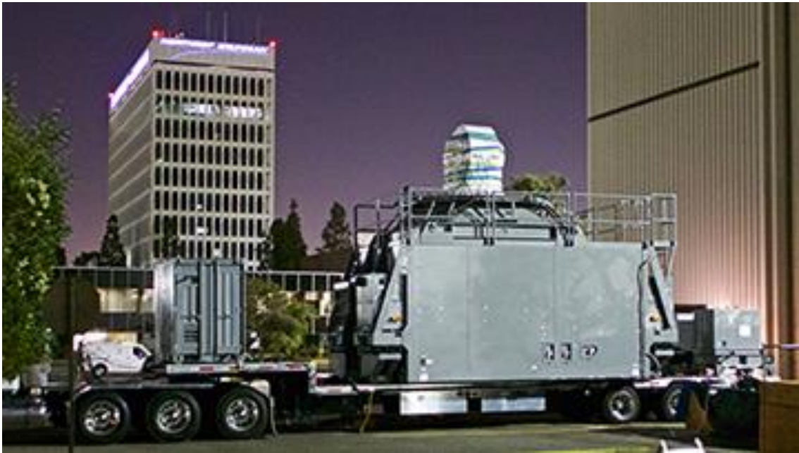
Figure 6. Reported SSL-TM Laser Being Transported