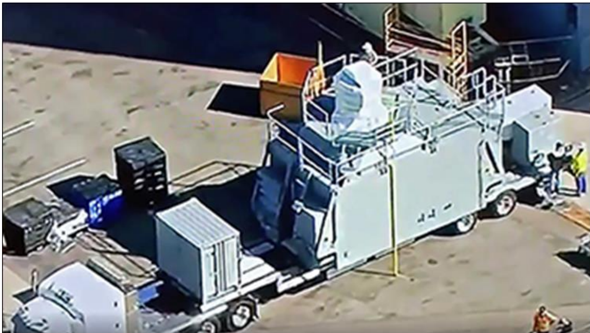
Figure 7. Reported SSL-TM Laser Being Transported