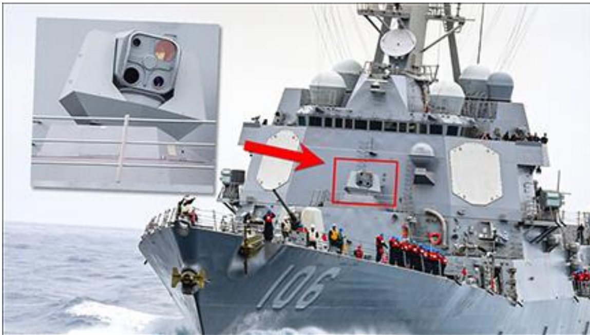
Figure 9. Reported ODIN System on USS Stockdale