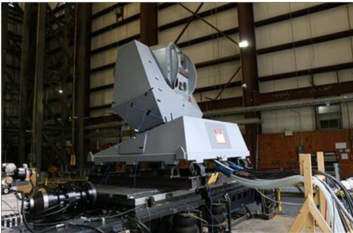
Figure 10. Reported ODIN System at Naval Support Facility Dahlgren

Source: Photograph accompanying Brett Tingley, “Here’s Our Best Look Yet At The Navy’s New Laser Dazzler System,” The Drive , July 13, 2021. The caption to the photo states that it shows “OSIN being tested at Naval Support Facility Dahlgren [VA] in 2020.” The article credits the photograph to the Navy.