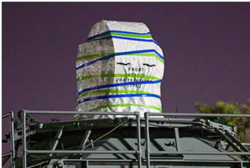
Figure 8. Reported SSL-TM Laser Being Transported