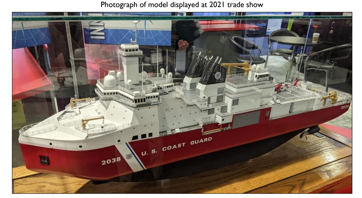
Figure 2. Model of Halter Marine Design for PSC