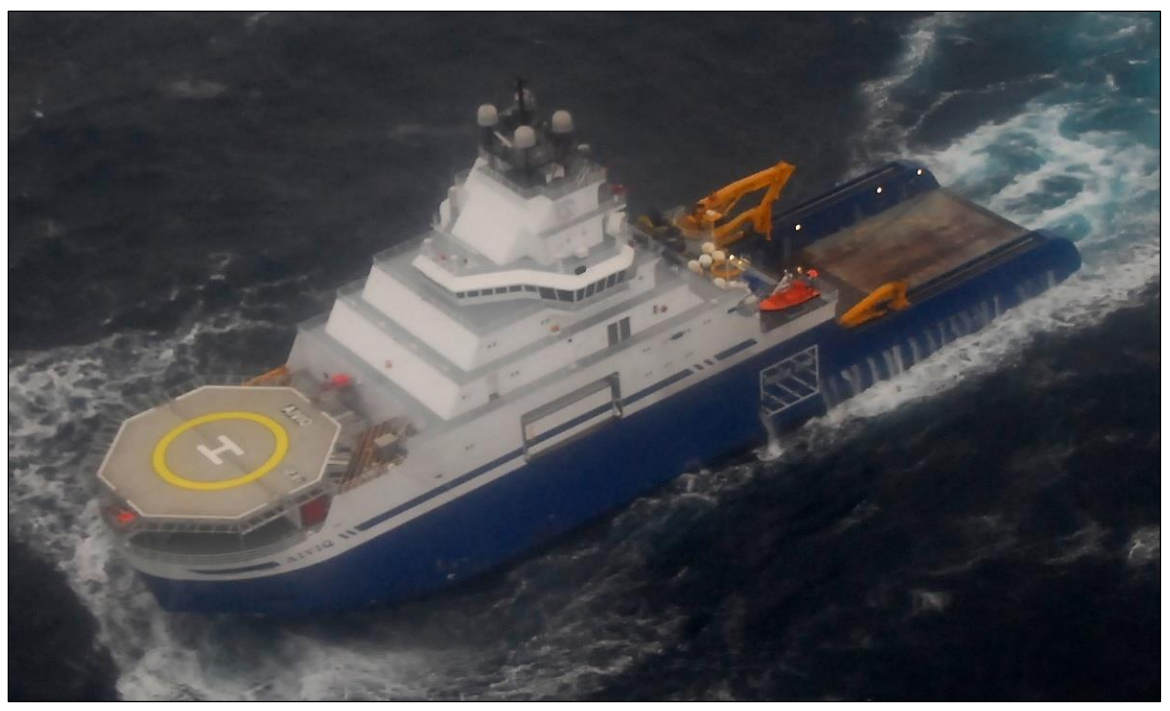
Figure A-8. Commercial Ship Aiviq