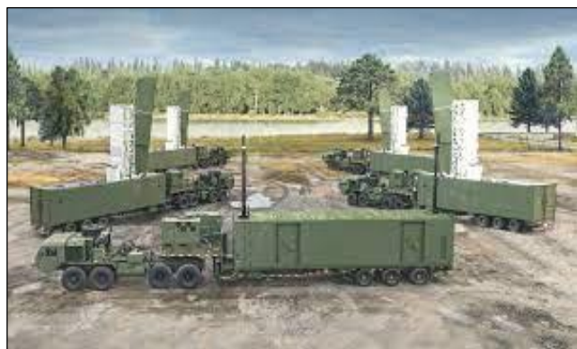
Figure 1. Typhon Launchers and Battery Operations Center