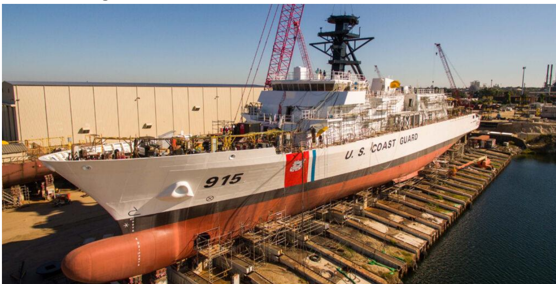
Figure 8. First Offshore Patrol Cutter Under Construction

Source: Photograph accompanying Chuck Hill, “Christening and Launch Ceremony for U.S. Coast Guard’s First Offshore Patrol Cutter Friday, October 27, 2023”—Eastern Shipbuilding,” Chuck Hill’s CG Blog , October 17, 2023. The caption credits the photograph to Eastern Shipbuilding.