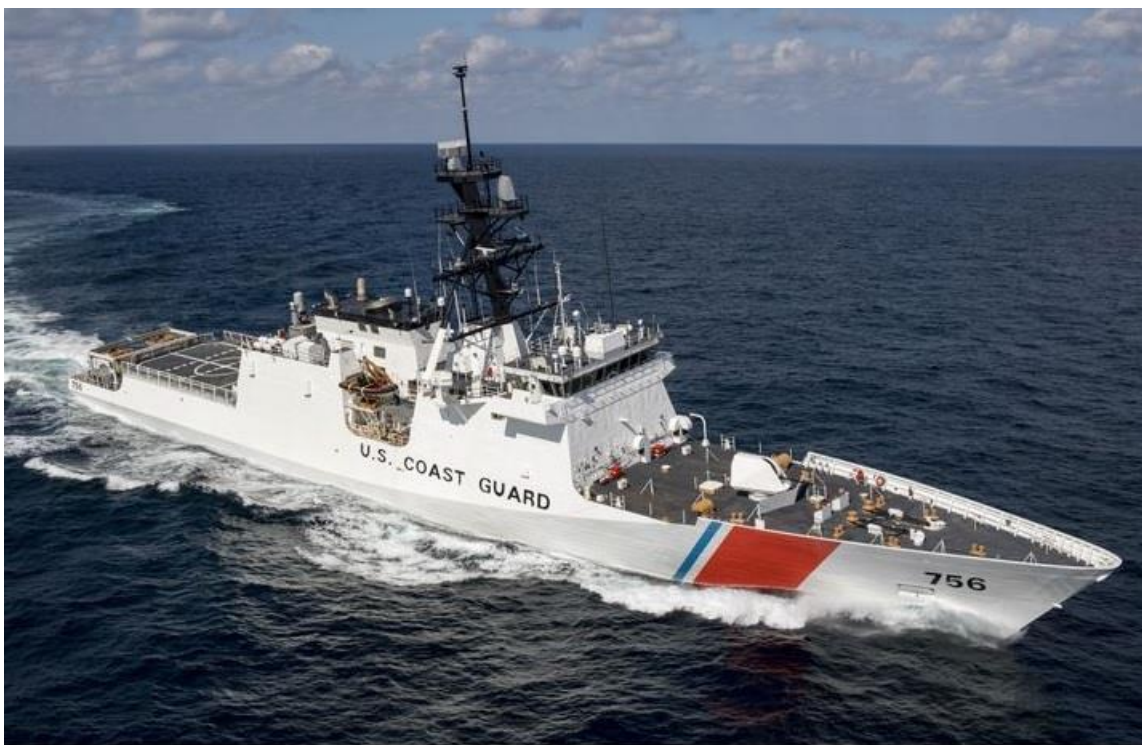
Figure 1. National Security Cutter