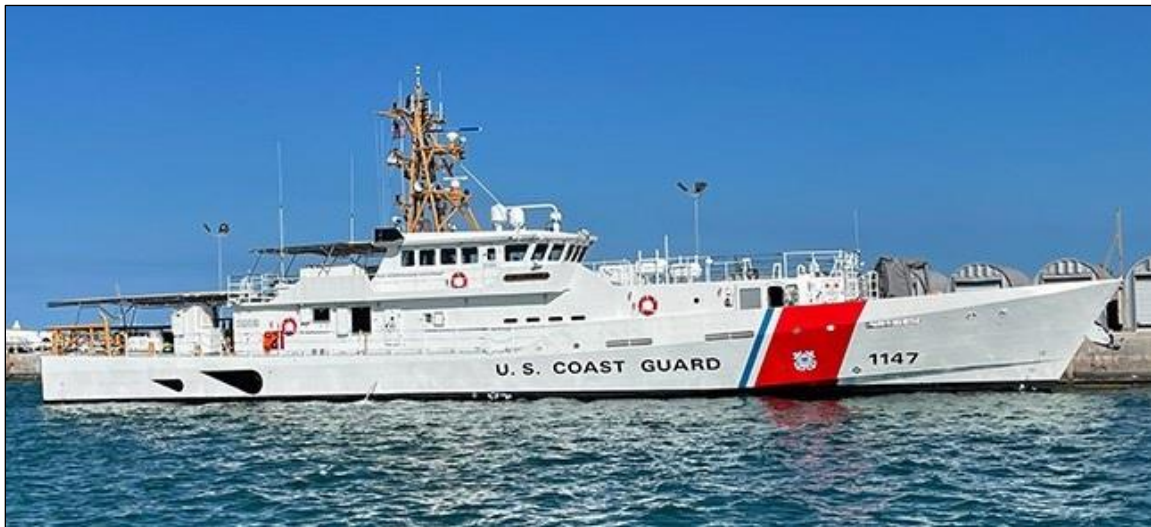
Figure 11. Fast Response Cutter