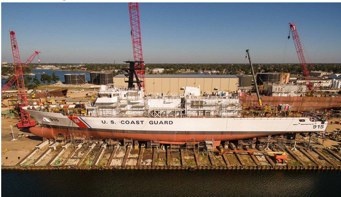
Figure 7. First Offshore Patrol Cutter Under Construction